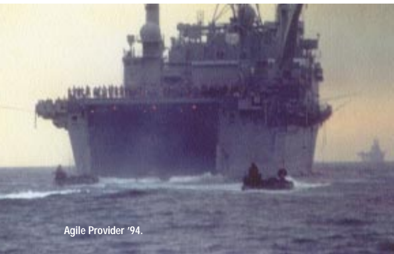
Agile Provider '94.