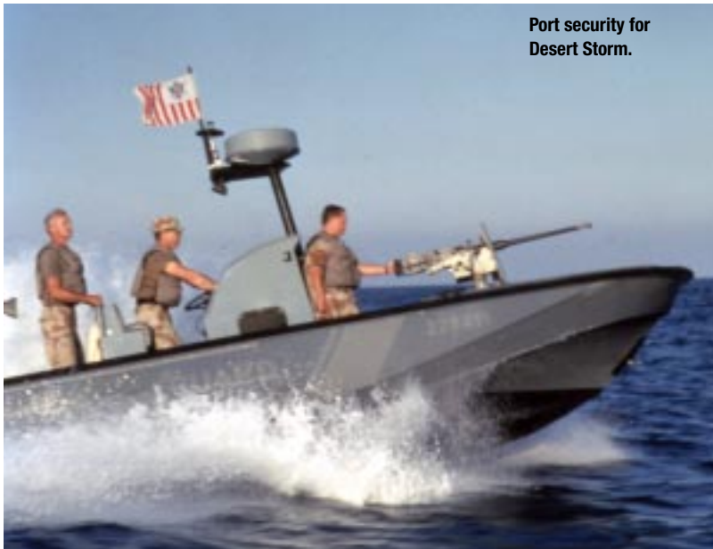
Port security for Desert Storm.