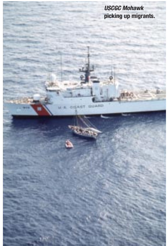
USCGC Mohawk picking up migrants.