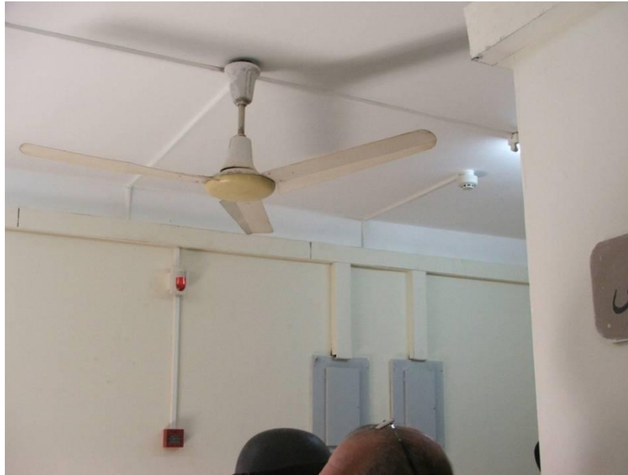
Site Photo 13. Installation of fire alarm system.