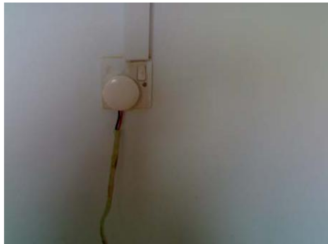
Site Photos 16 and 17. Corrective actions taken by contractor as a result of daily QA reports

GRC's QA program compensated for the inadequate contractor QC program and is ensuring the successful renovation of the Haditha General Hospital.