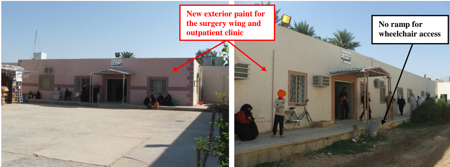
Photos 3 and 4. Exterior of the surgery wing and outpatient clinic buildings

The parking lot had no effective means of channelization or control of internal circulation of traffic. Vehicles were parked in a haphazard manner, which reduced the number of parking spaces available. The parking area was surfaced with dirt and gravel, and had no provisions for surface drainage. Because of the distance from the parking lot to the entrance and the dirt and gravel surface, patients are forced to traverse uneven muddy ground.