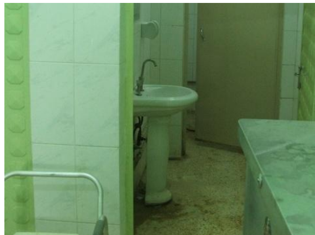
Photos 10 and 11. Heart monitors and defibrillator machines (left) and standing water on the restroom floor (right).