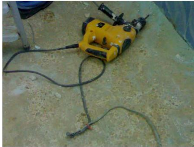
Site Photos 14 and 15. Unsafe electrical practices used by the contractor and captured in daily QA reports