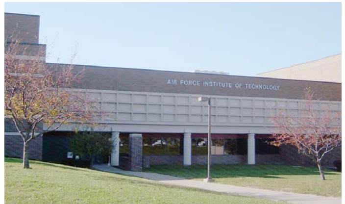
Air Force Institute of Technology (AFIT)