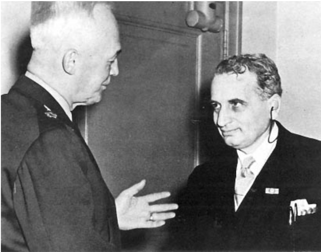
Arnold awards Kármán the Meritorious Civilian Service Award for his work on Toward New Horizons , February 1946.