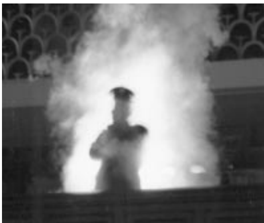
The Arnold "apparition" in the balcony at the NAS that evening

ward Teller, coinventor of the "dry" hydrogen bomb that made the ICBM a practical weapon. General Arnold himself even appeared as an "apparition" from the balcony at the banquet in the NAS that night as part of the entertainment program.