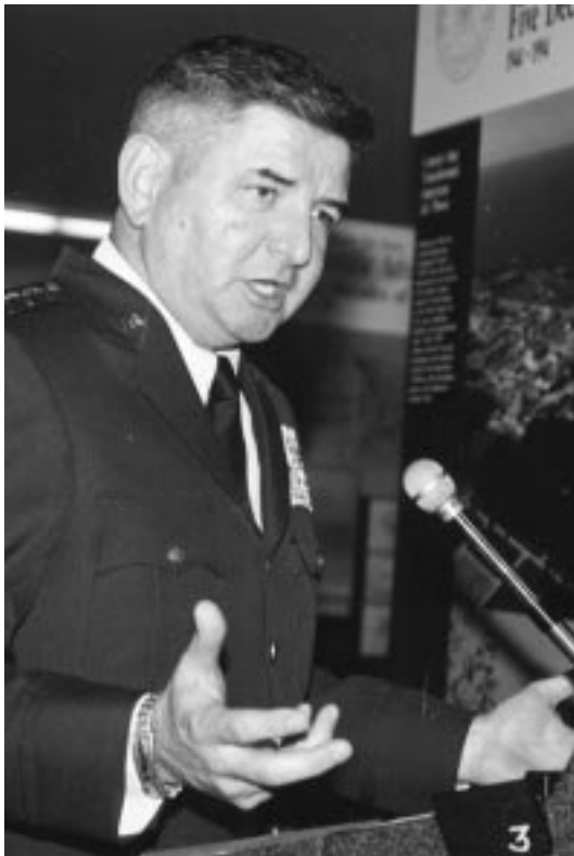
Gen Ronald R. Fogleman addressed the SAB members, past and present, at the gathering at the NAS on 10 November 1994.