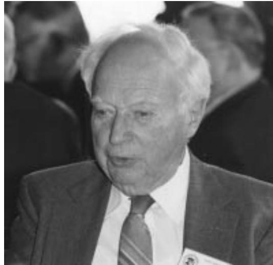
Ivan Getting, father of the global positioning system