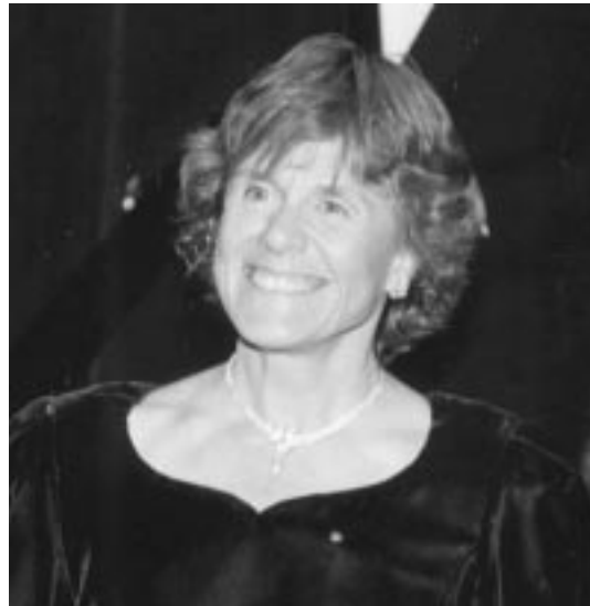
Secretary of the Air Force Sheila E. Widnall enjoyed the formal gathering at the NAS on the evening of 9 November 1994.