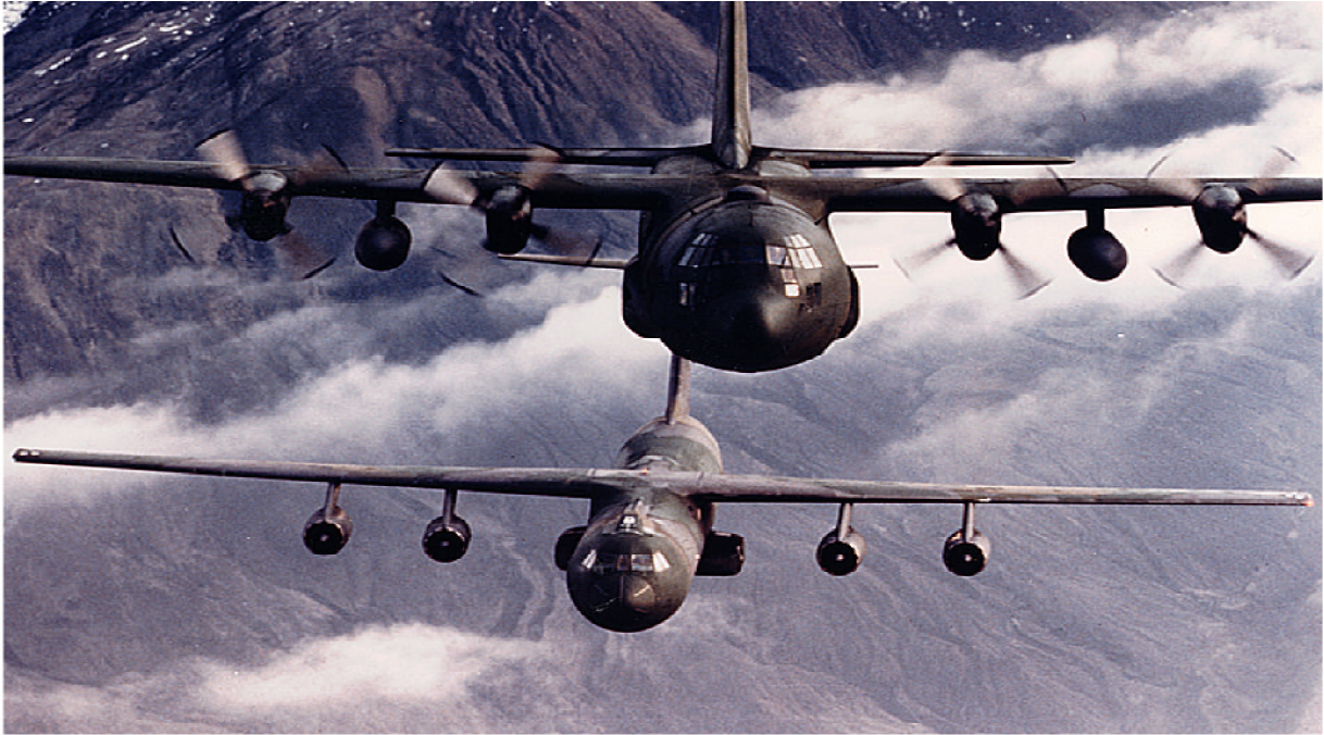
The Balkan War has dramatically shown us that our airlift fleet will now be called upon to operation in hostile or potentially hostile areas. Crew tactics, training, and doctrine must address when and how to use airlift assets in such scenarios.

24 hours a day and for 365 days a year to deny certain armed forces the use of combatant aircraft, the system has proven to be effective. On 28 February 1994, F-16 fighters under AWACS control downed four J-1 Jastreb 26 aircraft that were attacking ground targets inside the no-fly zone. 27 In this mission, F-16s have proved to be adequate for such situations. The AWACS, as in the Gulf War, has provided surveillance and targeting information essential for enforcing no-fly zones.