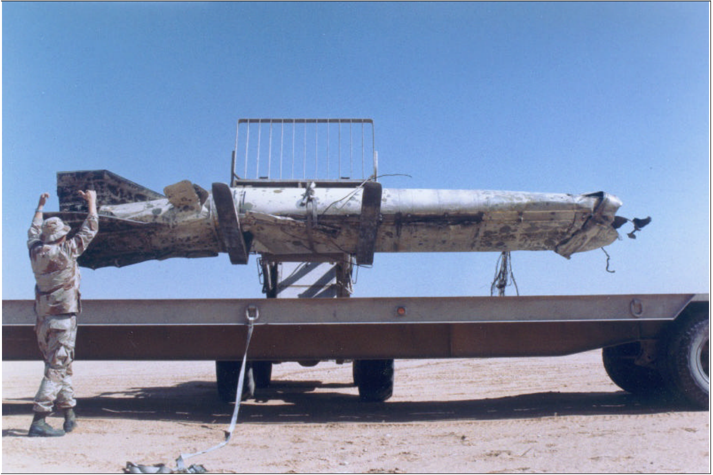
While on the surface it appears the counter-Scud operations enjoyed some success in achieving their objectives, closer examination reveals several major shortcomings. A defeated Scud (above) and Scud damage (below, left and right).