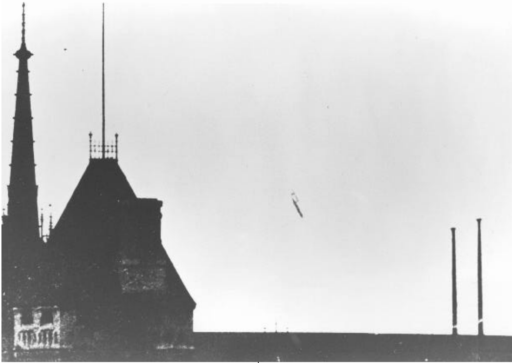
A V-1 ends its flight. Airpower failed to achieve its objective of "limiting the intensity" of either the V-1 or V-2 once German launch operations began.

pressures and their impact on resource allocations as a result of the attacks on Israel. In both World War II and the Gulf War, airpower was the principal means employed to stop enemy missiles, and in each case the results were at best inconclusive, and at worst, absolute failures. 8