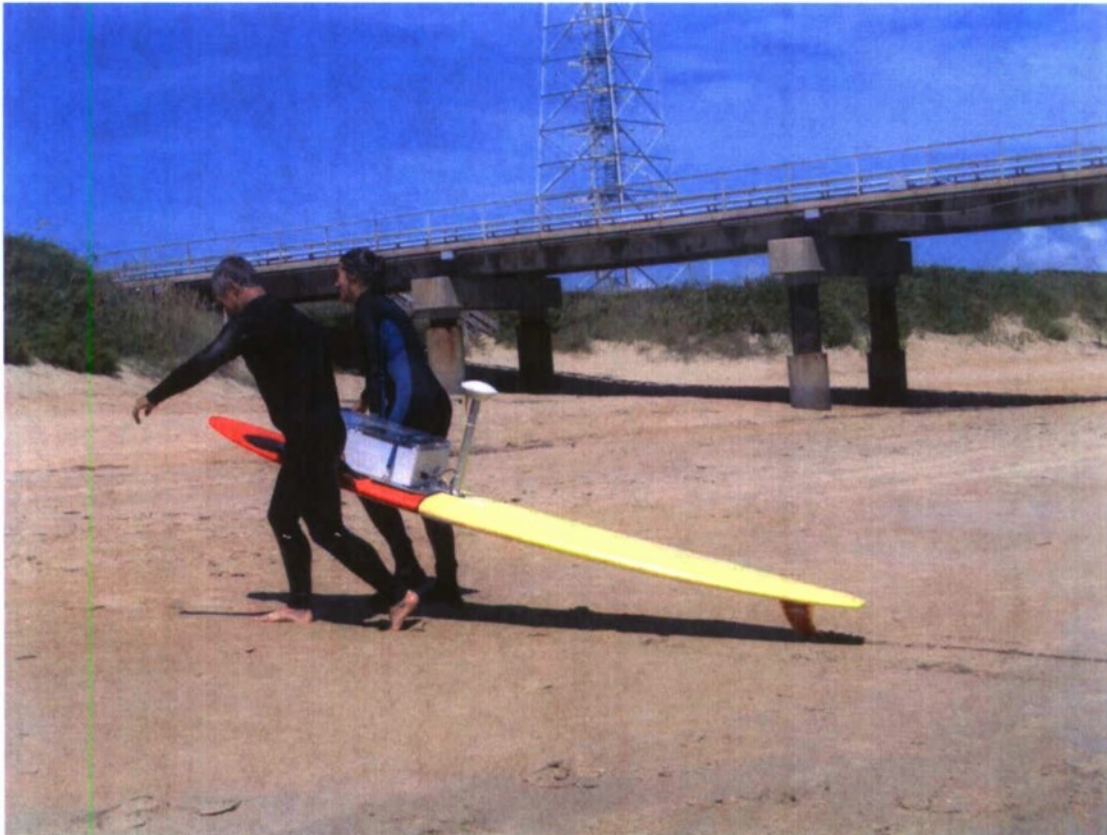
Figure 2: Photograph of the surfboard based GPS (white disk in center is the antenna) and sonar (under the surfboard) survey system. The white box on the handlebars contains a waterproof computer to operate the system. After carrying the 70 pound device to the water line, a swimmer paddles the surfboard along cross-and alongshore transects to map the sea floor in very shallow water.

2) A surfboard-based GPS+sonar survey system (Figure 2) for inner surf zone mapping. An example map of the inner surf zone seafloor where a large hole had been excavated is shown in Figure 3.