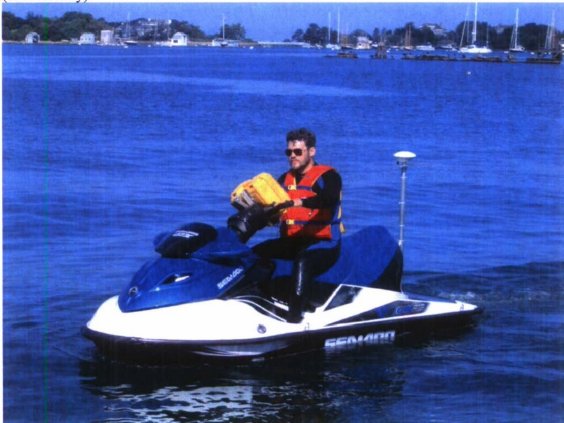
Figure 1: Photograph of the wave runner based GPS (white disk on stern is the antenna) and sonar (under the hull) survey system. The yellow box on the handlebars contains a water proof computer to operate the system and to display a map of transect lines for the operator to follow while mapping the seafloor.

1) A wave runner-based, GPS+sonar survey system (Figure 1) was constructed and tested (successfully).