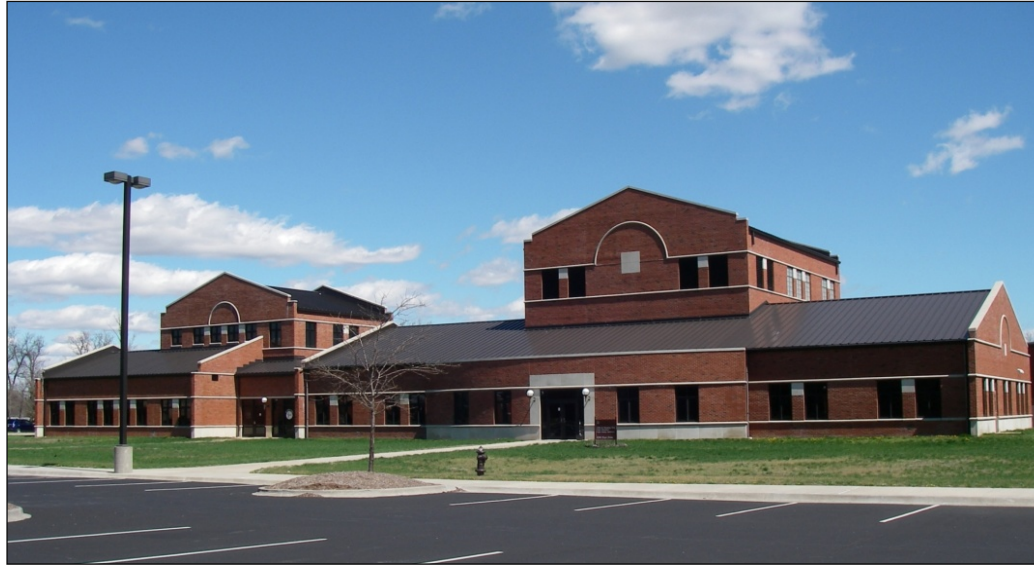
MAF Distributed Training Center (DTC), Scott AFB IL