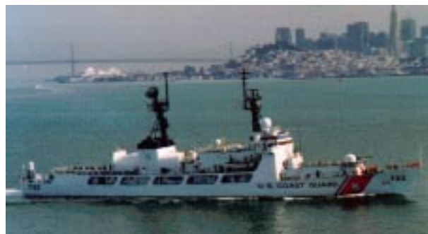
USCGC Morgenthau (WHEC 722) departs homeport in Alameda, California, enroute to a Western Pacific Patrol.

One of the concerns over the upgrading in security of ports is that unlike airports, ports are privately owned and operated and legislating changes will impact on the “bottom line” of the owners. But “the bill authorizes more than $1.1 billion over six years, including grants to local port authorities, plus another $3.3 billion in loan guarantees for local port authorities to finance security improvements. Part of the cost is offset by an extension of the existing tonnage tax on cargo.” 7 This is a quantum leap in securing imports as “the United States has 361 coastal and inland ports that handle 95 percent of the nation’s cargo coming from countries other than Canada or Mexico.” 8 And “currently, the United States has no centralized port authority. Federal, state, and local authorities all share jurisdiction.” 9