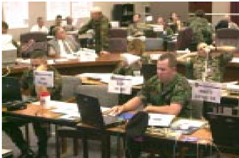
Figure 2 – JTF CS Staff

By using the success criteria defined in the JTF-CS CONPLAN, it is clear to see that JTF-CS accomplished all tasks satisfactorily.