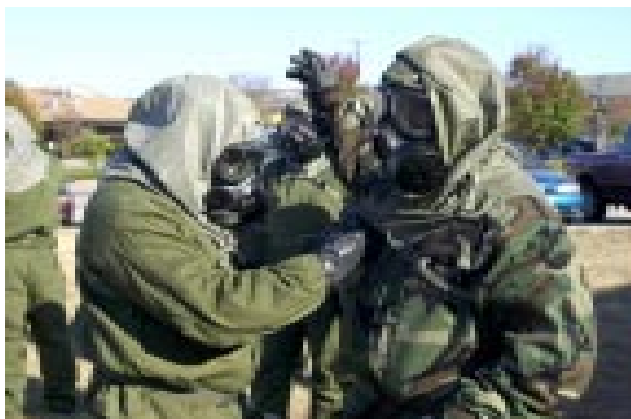
Figure 1 – CBRNE Training

Using federal military forces to help state and local officials is not a new concept. Federal assistance in times of crises has frequently been provided by the military. The establishment of JTF-CS is a major step in strengthening DOD's overall capability for responding to CBRNE consequence management incidents. CBRNE consequence management requires a coordinated response at three levels - local, state, and federal - and the Department of Defense strategy includes support at each level.