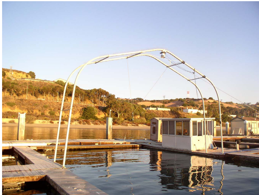
Figure 2. Picture of the floating test site. The overhead frame supports two cameras that look down on the 30x60 ft pen. The control hut, from which operations are run, is on the opposite side of the camera frame. Station B, behind which the sound emitting transducer hangs, is the at the mid-point of the far end of the pen.