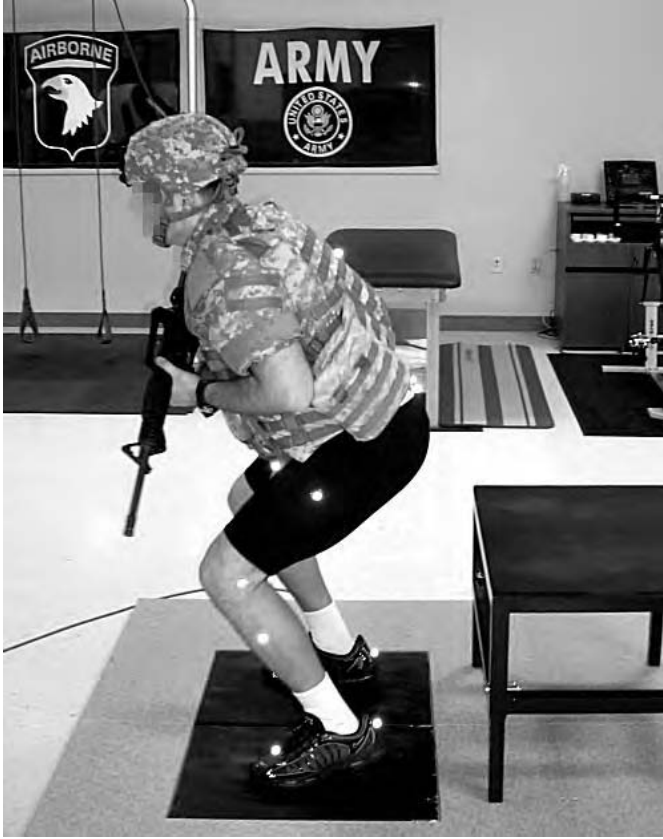
Figure 1. Two-legged drop landing task, IBA condition