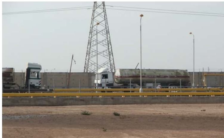
Site Photo 4. Diesel Trucks Delivering Fuel to Qudas Power Plant

Fuel Supply – According to a 22 April 2005 Defense Support Office report which evaluated Iraq's Electricity Sector, there is no national fuel strategy. Thus, refined fuel such as diesel is in short supply. Lack of refining capacity has limited the production of diesel in Iraq. The Ministry of Oil supplies the fuel used in Iraqi power plants. The Defense Support Office reports that the Ministry of Electricity is being supplied with about one third of its diesel needs. Further, at Qudas, the LM-6000s fuel supply is provided by trucks delivering diesel on a daily basis (Site Photo 4). There is no dedicated supply of fuel via pipeline for the LM-6000s.