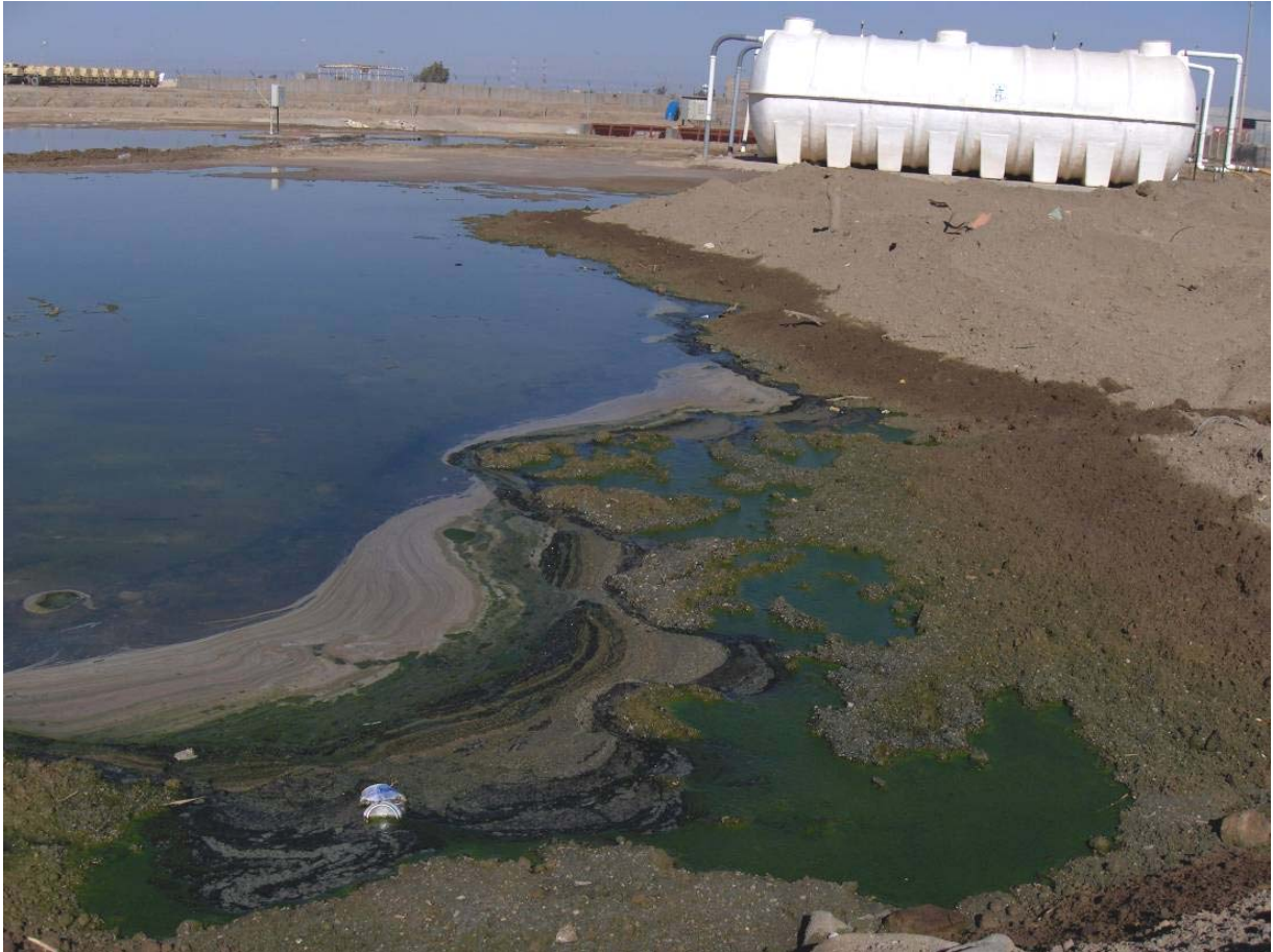
Site Photo 4. Sewage overflows around the holding tanks.