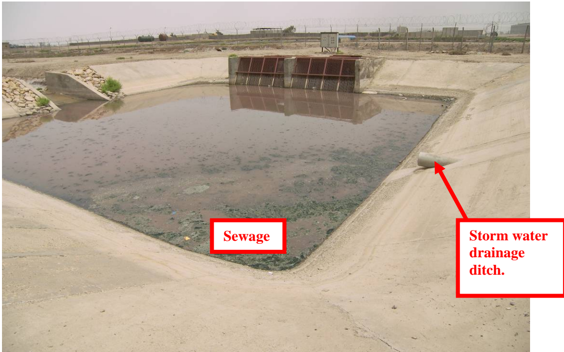
Site Photo 14. Storm drainage collection pond containing raw sewage.