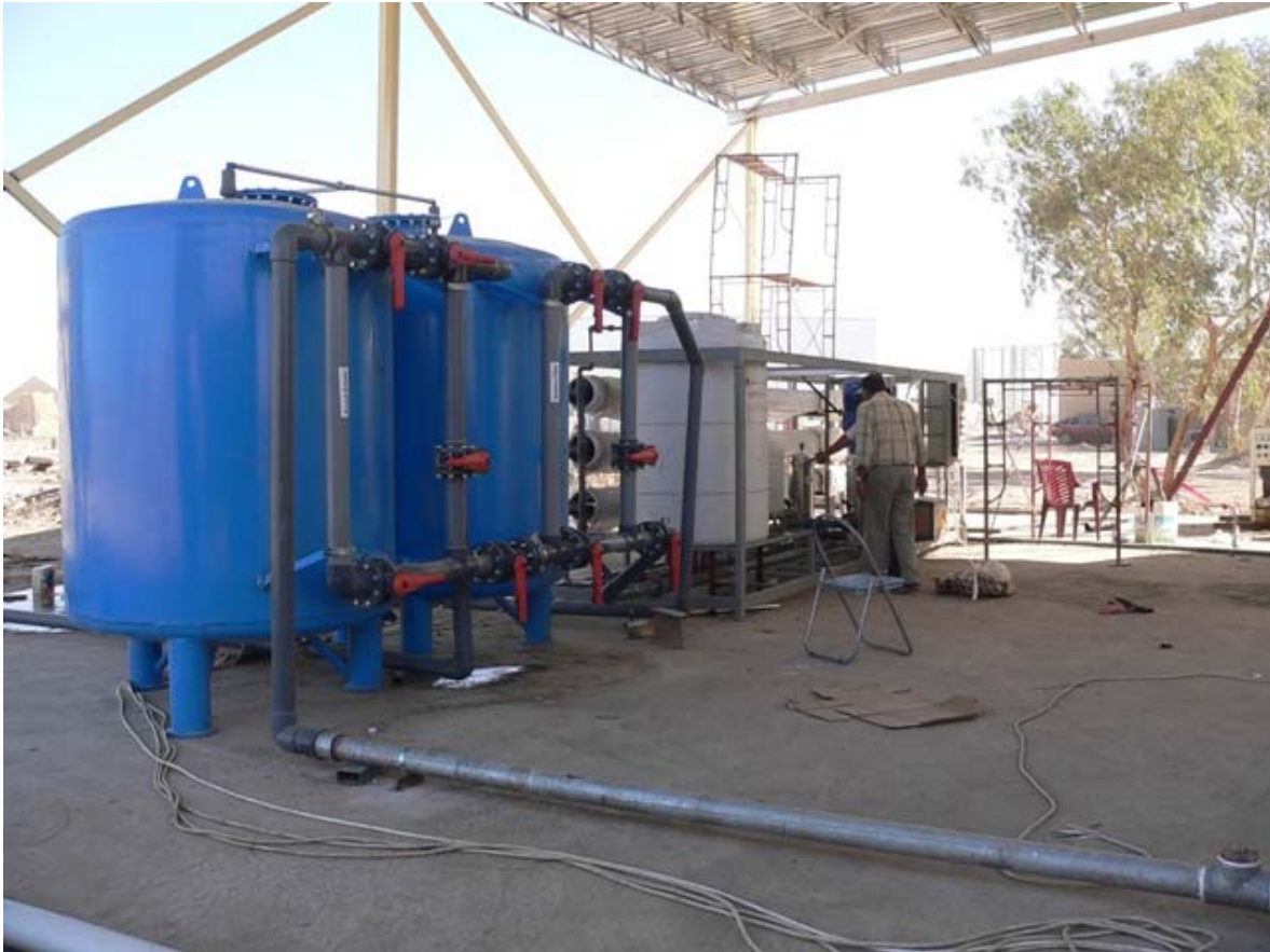
Site Photo 6. Reverse osmosis unit at installation.