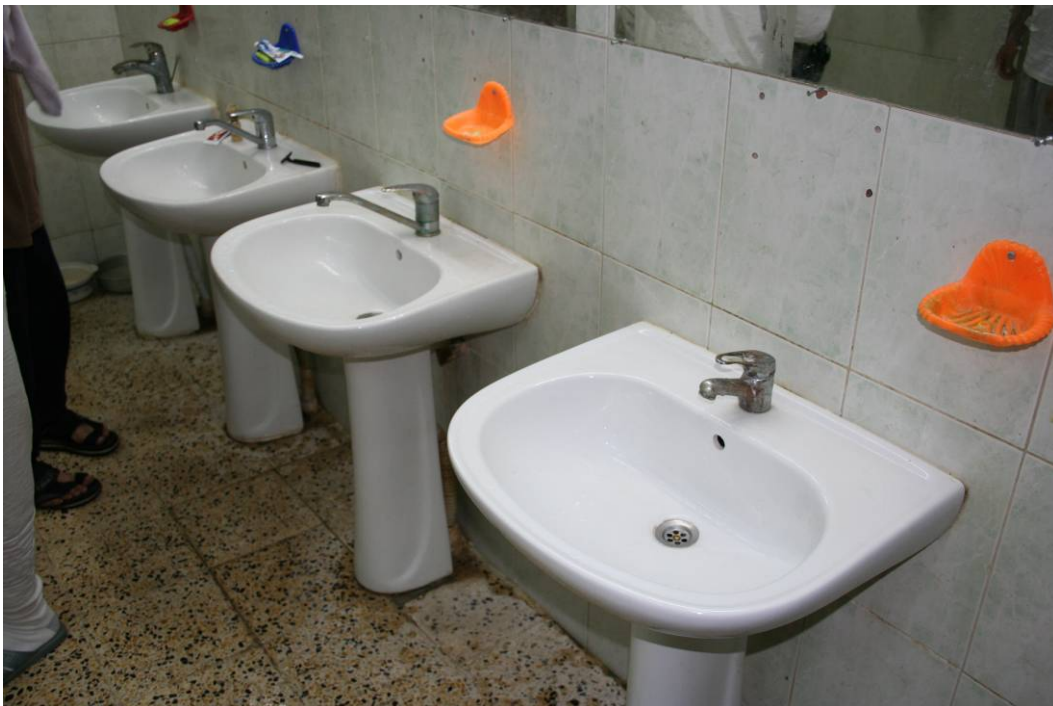
Site Photo 9. Barracks bathroom in functional condition. Tile work, floors, sinks, and mirrors appeared in good condition.

SIGIR visited the base barracks as part of the inspection. Site Photo 9 shows the sinks in the barracks bathroom. The bathroom sinks, showers, and toilets all worked at the time of the visit. Additionally, bathroom tile work, suspended ceiling, lights, mirrors, and shower doors all appeared to be in good condition.