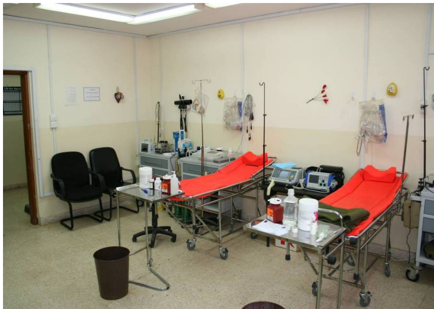
Site Photo 11. Base clinic emergency room

SIGIR found the base clinic to be a well-maintained facility with overall good construction. In Site Photo 11, the clinic emergency room appeared clean and well organized, with a working electrical system. Bathrooms, exam rooms, offices, pharmacy, dental room, laboratory, patient room, and other sections of the clinic were in similar condition.