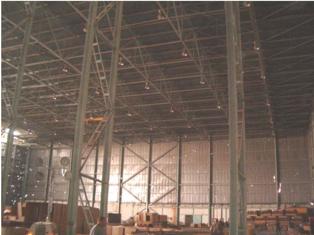
Site Photo 3. Pre-construction state of the hangar B-260, replacement metal needed on walls and roof.