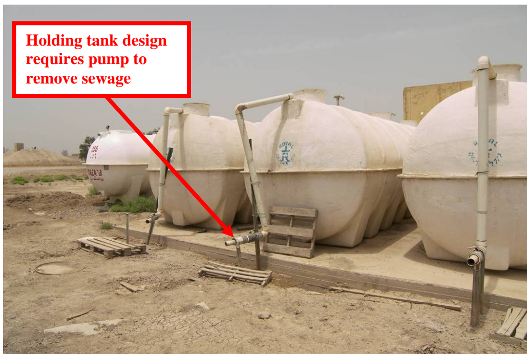
Site Photo13. Three sewage holding tanks designed to be pumped out.

The lack of O&M on the sanitary sewage system resulted in reduced performance of the storm overflow system and also caused a potential health hazard.