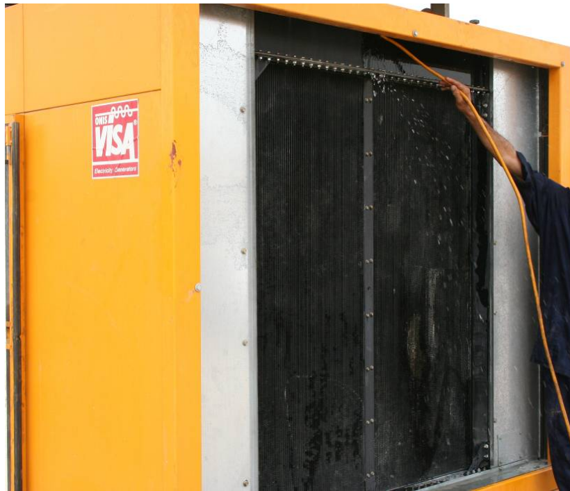
Site Photo 12. Worker cools a running generator with water.

The working generators appeared clean and the inoperative generators contained adequate oil. During SIGIR's visit, a worker sprayed one of the operating generator's radiator with a water hose (Site Photo 12). According to the worker's supervisor, the water was employed to cool the radiator. Water on the ground and on the radiator prevented inspectors from observing any possible coolant leak from the radiator.