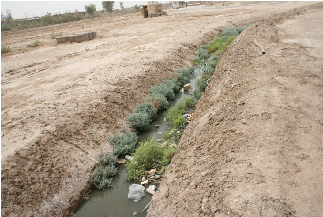
Site Photo 15. Raw sewage is pumped from sewage holding tanks into storm water runoff ditch