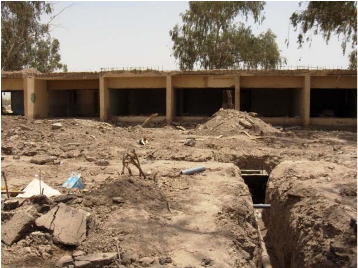
Site Photo 1. Pre-construction state of building B-230 front view. Extensive renovation work needed.

The largest structure in the renovation, the aircraft hangar that measures 80.55 meters by 135.86 meters, is shown in Site Photo 3. The pre-construction hangar needed new metal sheeting and roofing as well as renovation of the attached surrounding offices.