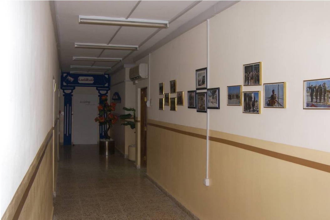
Site Photo 8 Headquarters building hallway was well maintained

SIGIR visited the base barracks as part of the inspection. Site Photo 9 shows the sinks in the barracks bathroom. The bathroom sinks, showers, and toilets all worked at the time of the visit. Additionally, bathroom tile work, suspended ceiling, lights, mirrors, and shower doors all appeared to be in good condition.