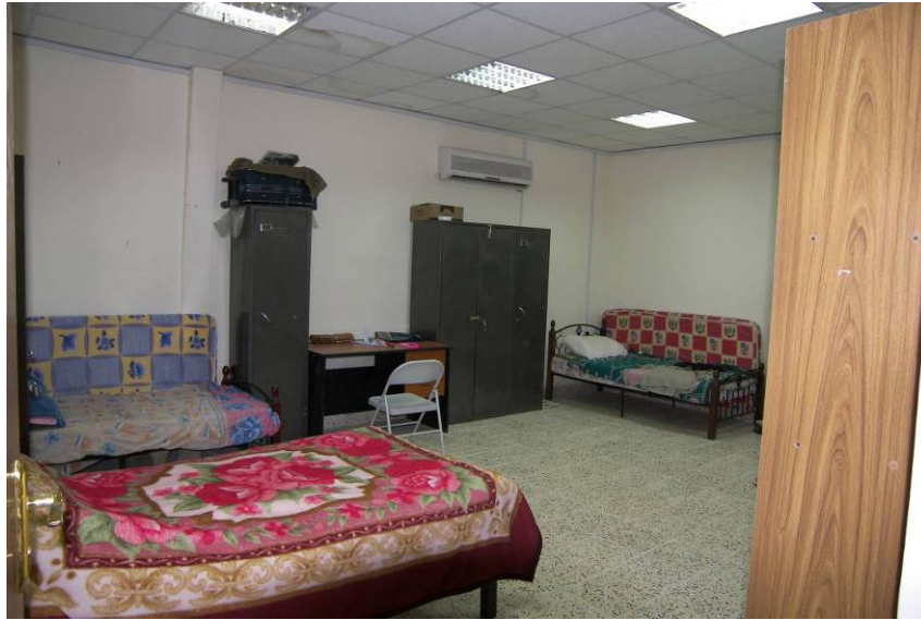
Site Photo 10. Barracks bedroom

Site Photo 10 shows a base barracks bedroom in relatively good condition.