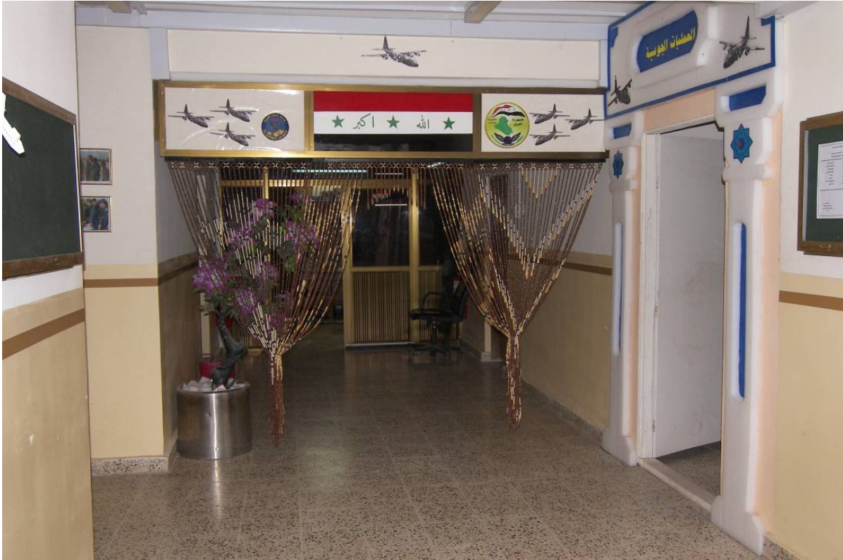
Site Photo 7. Headquarters building (B-300) appeared in good condition at the time of the site visit.

For example, in the headquarters building (base support offices B-300), (Site Photos 7 and 8) the interior construction remained fully functional and well maintained. SIGIR noted that although the Iraq Air Force occupied the headquarters building, items such as paint, sockets, switches, electrical wiring, doors, and floor tile work remained, most work appeared new and fresh. The building air conditioning and electrical components also worked well.