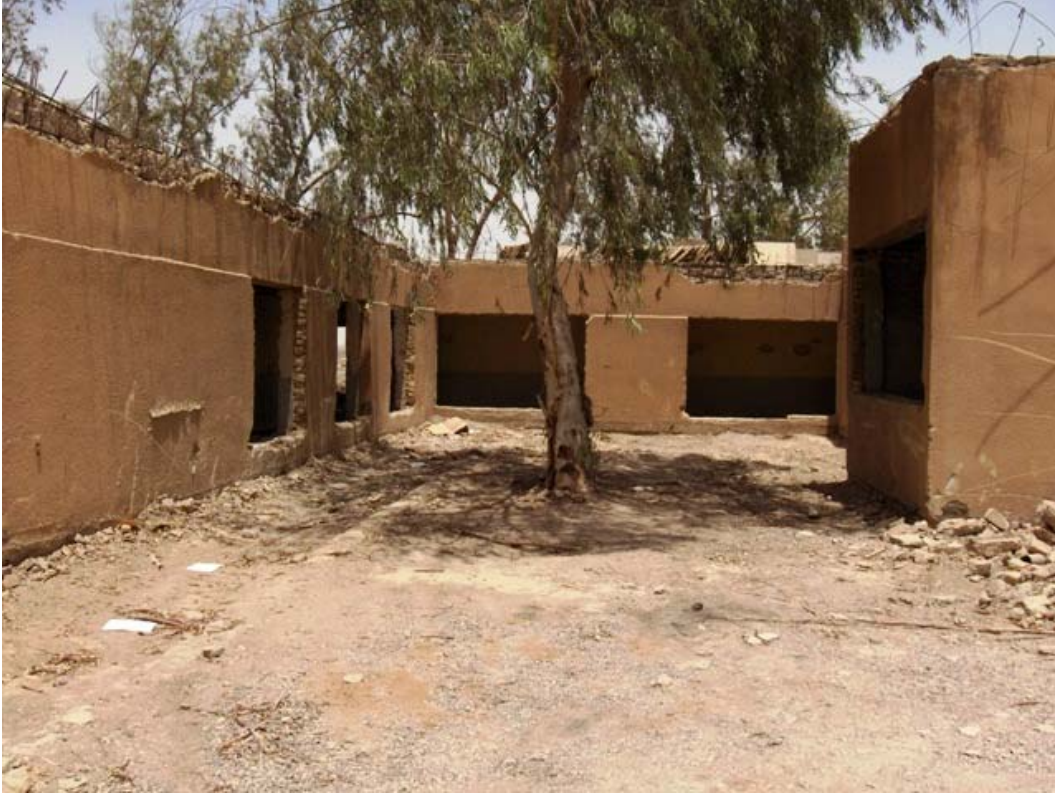
Site Photo 2. Pre-construction state of building B-230 courtyard, extensive renovations needed.