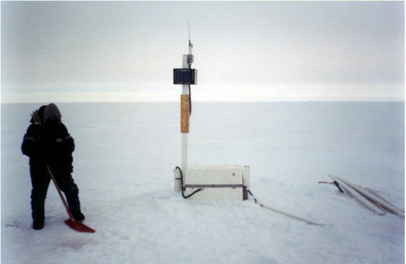
Fig. 1. One of the remote hydrophones stations deployed 50 km from the SHEBA main camp. On the post are four solar panels, a GPS antenna, and an ARGOS antenna. The box contains the data acquisition computer, anti-aliasing filters, and other electronics. The hydrophone is passed through the ice directly next to the electronics box. A stress sensor is deployed 10 m away. All cables run through conduit to protect them from animal bites.