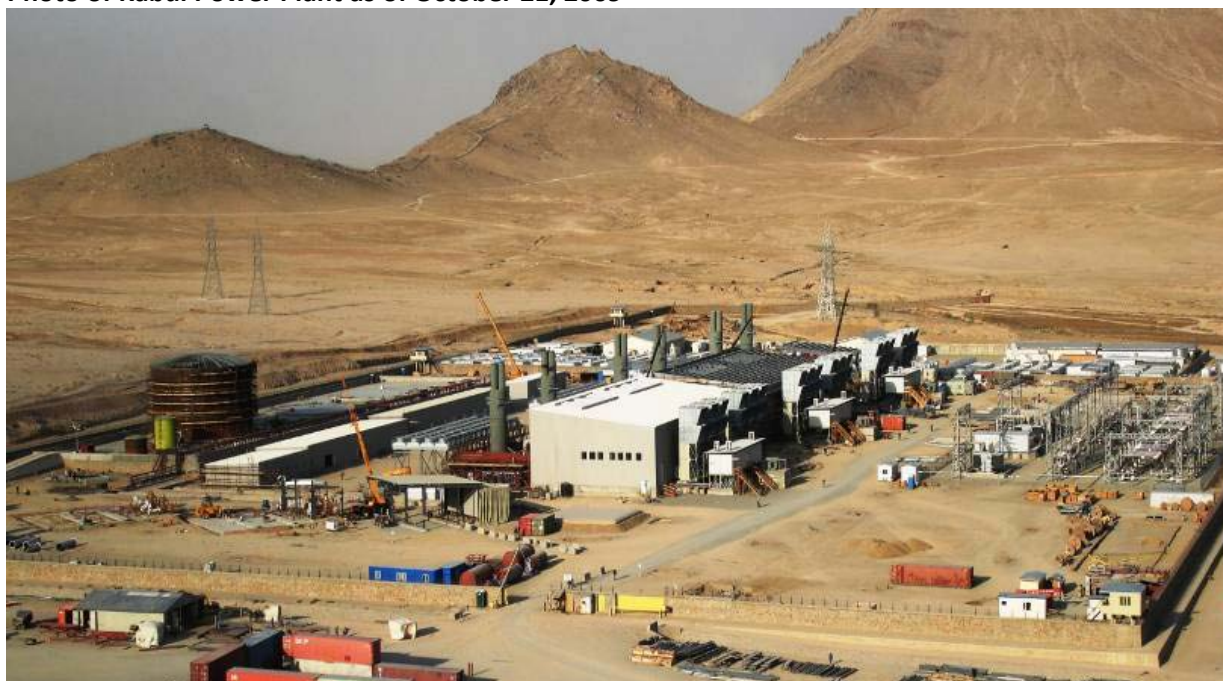
Photo of Kabul Power Plant as of October 21, 2009