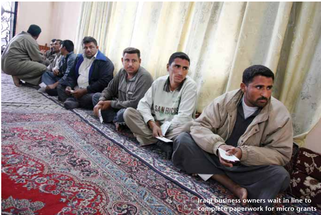
Iraqi business owners wait in line to complete paperwork for micro grants

In the second stage of the initiative, the U.S. Government should strive to develop the next generation of host nation entrepreneurs. To do this, I propose the incorporation of Western university educators and administrators into the JIATF organization to build up the host nation's human capital, which in the case of Iraq and Afghanistan has been left in a decimated state after years of authoritarianism, isolation, and war. Using the joint venture public-private partnership as a step-off point, the United States could use the newly acquired expertise to create in-country training and education in entrepreneurship, business administration, and management. This training and education would most likely begin as a follow-on program for individuals involved in the joint venture public-private partnership initiative; however, successful piloting of the program could lead to its wider adoption. And as an added benefit for top students, programs akin to the Fulbright scholarship can be designed to bring students to U.S. schools and companies to learn and gain hands-on experience. Although discussion of the role of education and training is limited by the scope of this article, we cannot discount the central nature of these follow-on initiatives in the long-term success of the broader economic initiative.