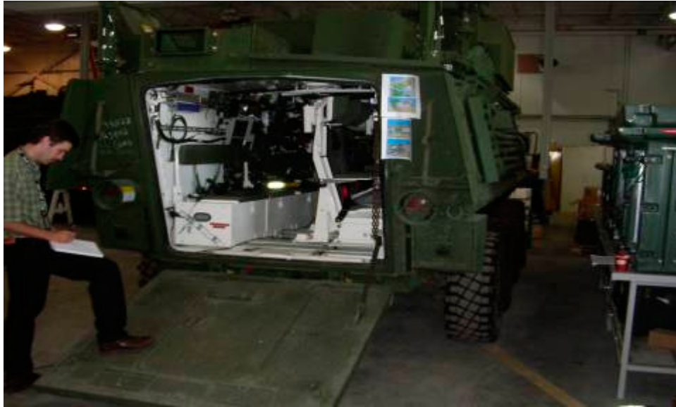
Figure 1: The Bison C3I mobile command post.

Subjects used a standard laptop keyboard for responding. The host computer controlled the timing of events, played the messages, recorded and displayed the trial by trial responses and computed the results for each condition in terms of hits (responding accurately when the subject's Call Sign was presented), misses (not responding to the Call Sign) and false alarms (responding to a Call Sign that had not been assigned).