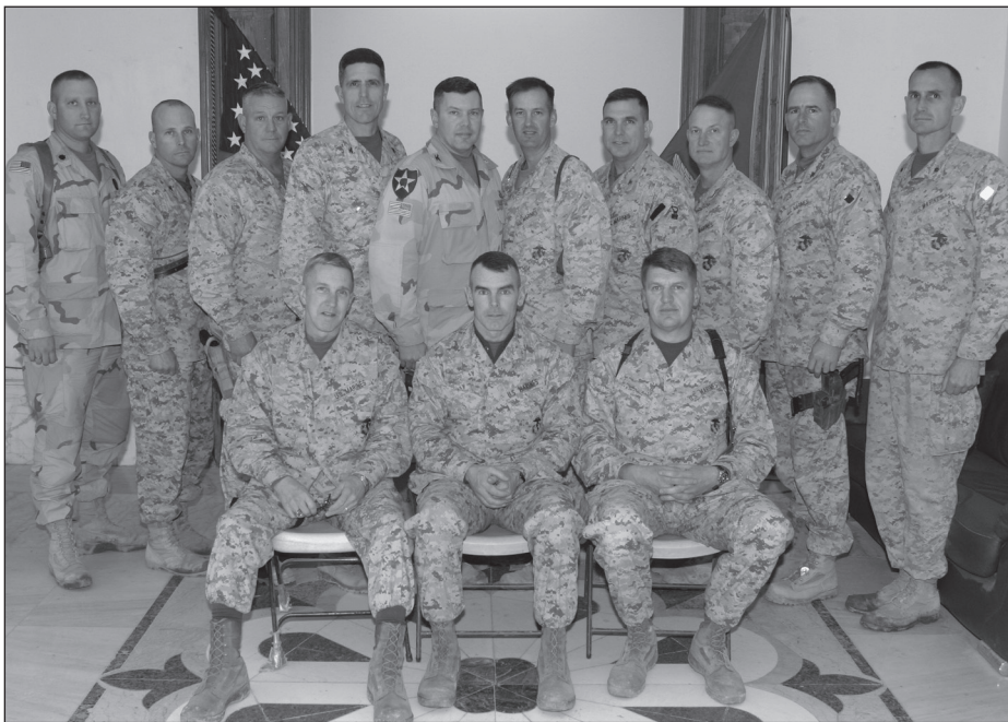
Leaders of the 1st and 2d Marine Divisions pose during their transfer of authority conference.

News of the 224th Engineer Battalion’s use of COTS software to analyze data from existing databases arrived at the Joint IED Defeat Task Force in mid-summer 2005, and the task force commander visited the 224th in Ramadi. After participating in a route clearance mission there, using the battalion S-2’s projection tools and operating picture, he said that the S-2 section provided more real-time, usable, and actionable intelligence than any other S-2 section he had ever seen. An overview of the process was briefed for the staffs of the 101st Airborne and 3d Infantry Divisions, the 130th Engineer Brigade, and other organizations.