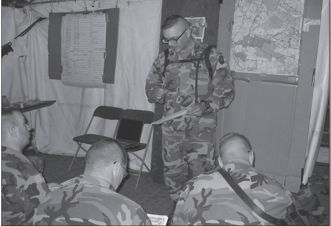
A 224th Engineer Battalion officer gives a briefing at Fort Hood in 2004.

Force Ironhawk support throughout the MEF. Commanders of all these units asked for engineer support with great frequency. The 2d MarDiv commanding general made the final approval on who received which resources.