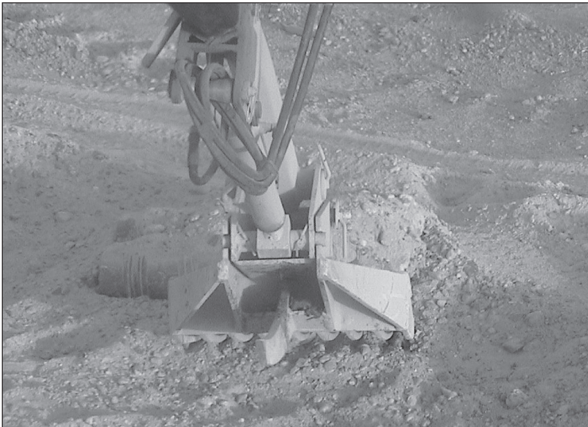
A Buffalo arm investigates an IED buried on the shoulder of a road.

After supporting the 1st Marine Division (MarDiv) and 11th Marine Expeditionary Unit (MEU) during the election in Najaf in January 2005, the 224th Engineer Battalion, Iowa Army National Guard, relocated to Ramadi to conduct a relief in place of the 2d Battalion, 11th Marine Regiment, accepting responsibility for five convoy security escort teams. Augmented with a United States Marine Corps company, the battalion's mission was to reduce the 70 percent success rate of IED attacks against coalition forces in Anbar. Route clearance, or mobility operations, would become the 224th's main effort throughout the deployment.