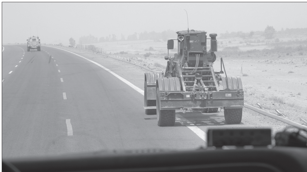
A “mechanical” route clearance team operates on MSR Mobile in Anbar Province.

While route clearance recommendations were made to the 2d MarDiv operations, plans, and training (G-3) staff, the brigade and regimental command teams in MNF–W also requested 224th route clearance resources—known as Task Force Ironhawk—through the division G-3. The 2d MarDiv operated with three maneuver brigades, including the 2d Brigade Combat Team, 2d Infantry Division (Ramadi–AO Topeka); Regimental Combat Team 2 (Al Asad–AO Denver), and Regimental Combat Team 8 (Fallujah–AO Raleigh). In addition, the 155th Brigade Combat Team, Mississippi Army National Guard, attached to the II MEF, also was allowed to request Task