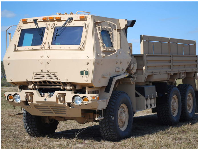
M1083A1P2 FMTV with B-Kit Armor

The Army's on-hand level of MTVs is currently equivalent to its force structure requirements, not including additional requirements in support of theater Operational Needs Statements (ONS). The Army requirements for the FMTV FoV have and will continue to increase to meet emerging DI requirements. These new requirements come as a result of armoring