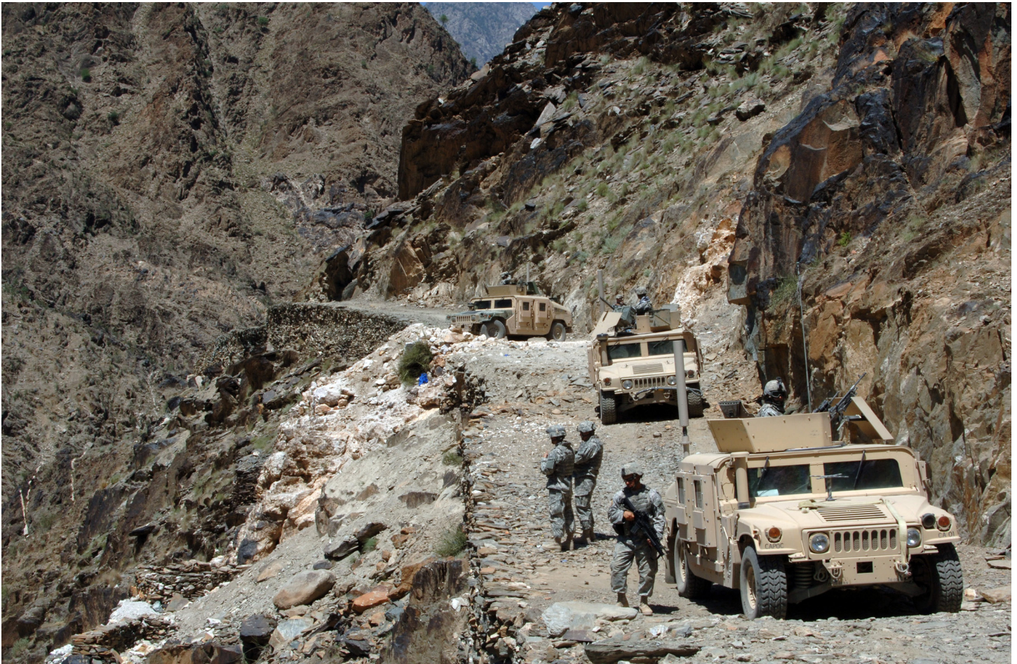
Unit Patrol in Afghanistan Mountains