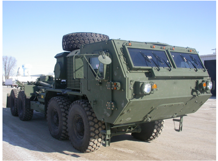
M1120A4 LHS with B-Kit Armor

The PLS is a key Army transportation system and is composed of a prime-mover truck with integral self loading and unloading capability, a 16.5-ton payload PLS-trailer and demountable cargo beds (Container Roll-On/Off Platform (CROP)/flat racks). The vehicles can be equipped with material handling equipment, winches, or Container Handling Units (CHUs). The primary mission of the PLS is the rapid movement of combat configured loads of ammunition and all other classes of supply, either containerized or non-containerized. The system also includes a PLS trailer, an Enhanced Container Handling Unit (E-CHU) for transporting 20 foot International Organization for Standardization (ISO) containers, a CROP, or M1077 flat racks.