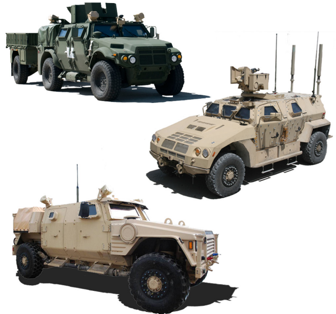
JLTV Technology Demonstrators

CAT C: Payload capacity of 5,100 pounds. Includes the following two variants: Shelter Carrier/Prime Mover/Utility (2 seats) and Ambulance (3 seats + 2 litters).