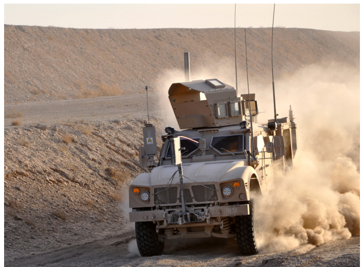
M-ATV with Objective Gunners Protection Kit