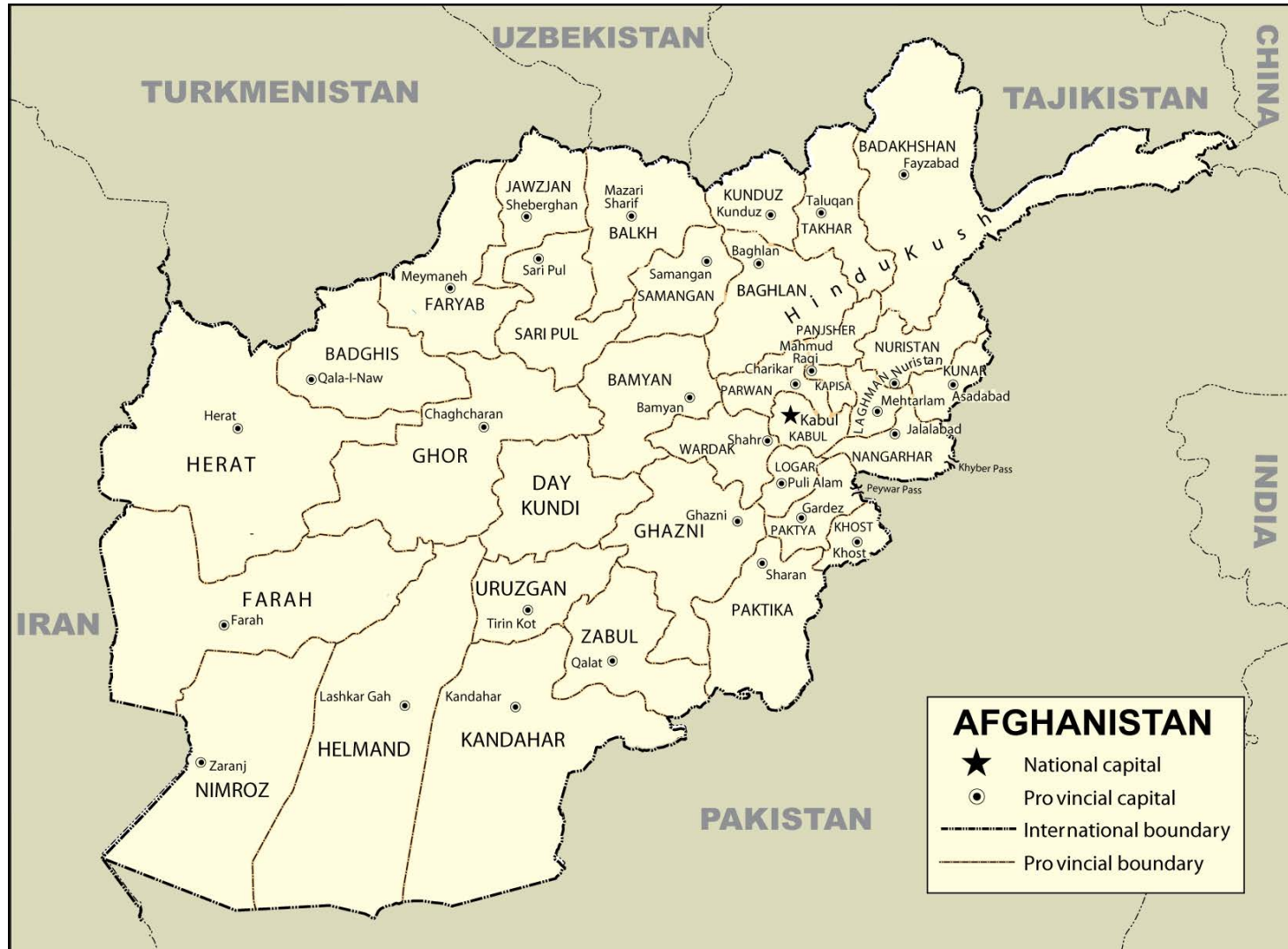
Figure A-I. Map of Afghanistan