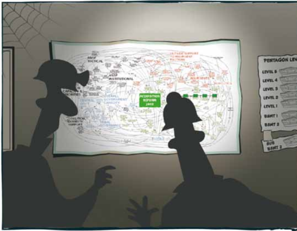
2145: Spelunkers discover ancient paintings in the Pentagon's sub-basement

contracting efforts provide an invaluable opportunity to empower Afghan businesses and create enduring political and economic change in Afghanistan. Economic success depends upon not just individual contracting officers pursuing innovative acquisition strategies, but also a collaborative whole-of-government commitment from all stakeholders. Together we can direct the full weight of our spending toward creating a self-sustaining economic backbone that will combat corruption, promote self-reliance, and support a stable security situation and effective governance.