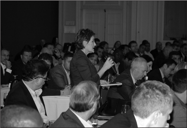
Question from the floor