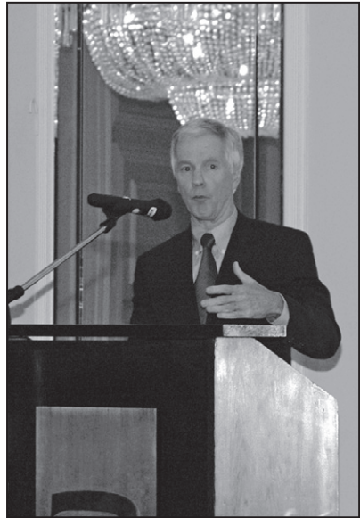
Ambassador Ryan Crocker

Ambassador Crocker centered his comments on that essential requirement for cooperation within the United States government and with other nations, intergovernmental organizations (IGOs), and nongovernmental organizations (NGOs). He drew linkages with the EPIC visit earlier in the day and said, “I like the Sovereign Challenge title” and the “unique opportunity to exchange views and perspectives among yourselves.” He affirmed the shared concern for nonstate actors challenging sovereign states resulting in transformational threats that require transformational responses. These threats are so compelling as to affect the way we think about sovereignty.