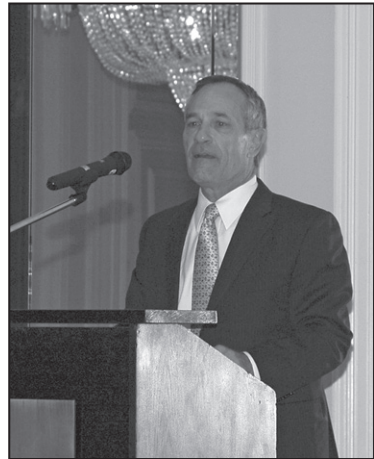
Commissioner Alan Bersin

Today requires a different view of the borders, a massive change in paradigms. The idea of a border is no longer a clearly defined “hard point.” Instead, the instantaneous flow of goods, people, capital, ideas, and information across borders presents new challenges and demands new approaches to identify and interdict potential threats. Thinking about those complex flows has replaced linear thinking defined by political boundaries or terrain. Confronting contemporary border challenges demands an extensive whole-of-government