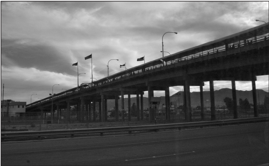
Pedestrian bridge from El Paso to Ciudad Juarez

By way of confirmation of Mayor Cook’s observations, members of the panel later suggested that the strategy of the drug cartels is to not have the violence spill over the border. Some rogue groups and individuals may do so, but not the cartels themselves. However, Mr. Mohar argued that while the violence may not be spilling over, the evidence suggests that cooperation is increasing between the drug cartels and U.S. drug dealers.