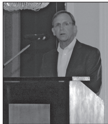
Admiral Eric Olson

Admiral Olson is the senior Special Operations officer and is the eighth commander of the United States Special Operations Command (USSOCOM). He began his address by explaining why USSOCOM is involved with the Sovereign Challenge initiative. Within the U.S. military structure, there needed to be a command that took a step back to synchronize and think across the geographic combatant commands — to provide understanding and perspectives.