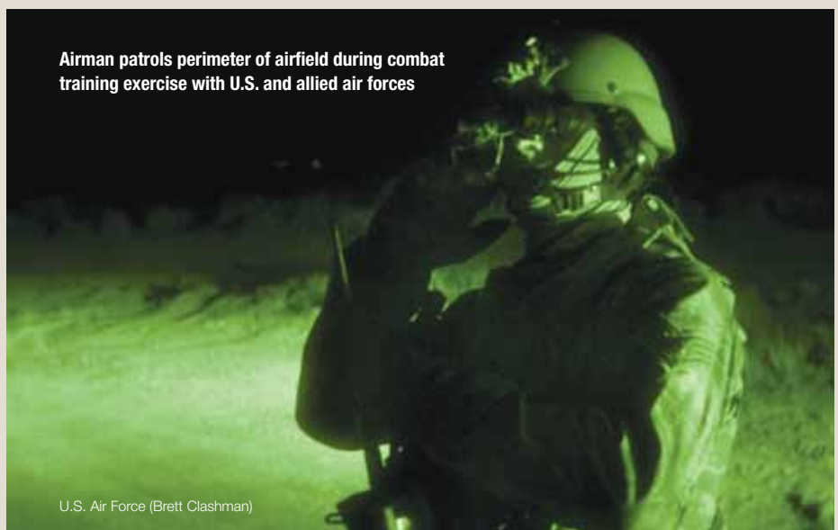
Airman patrols perimeter of airfield during combat training exercise with U.S. and allied air forces

Air Force guidance for mitigating the SAM threat to airfield approaches is found in