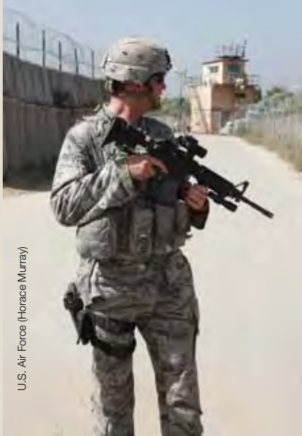
Airman scans street sector from outer wall of Bagram Airfield, Afghanistan, after insurgent attack