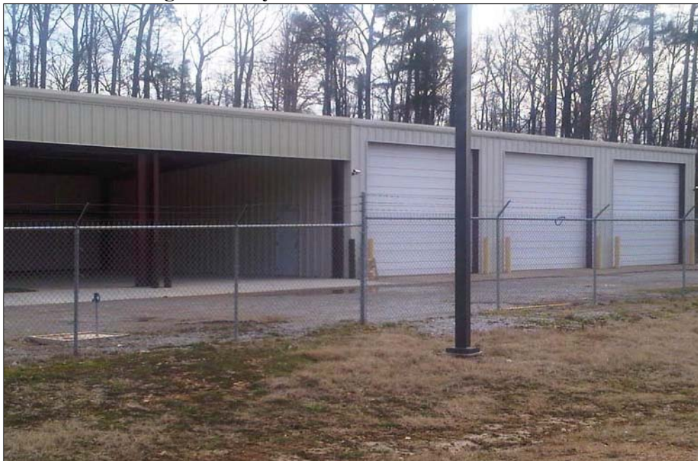
Figure 3. Bays at Yazoo Basin, Enid Lake