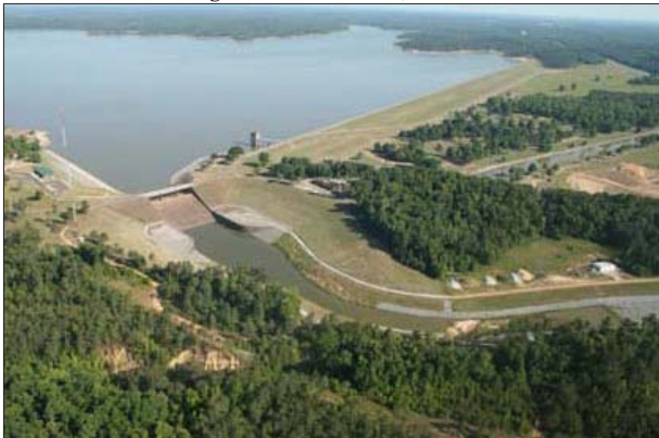
Figure 1. Yazoo Basin, Enid Lake