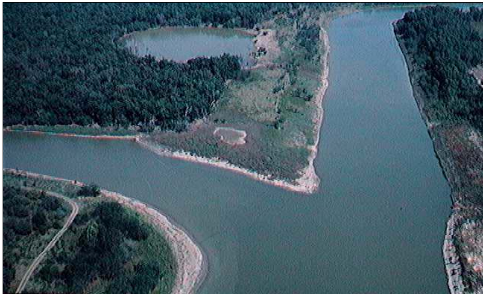
Figure 2. Tensas Basin, Boeuf and Tensas Rivers