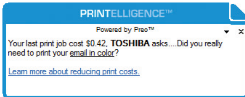
Figure 2. Print Management Objectives Pop-Up Example 1.

The power of the software also lies in its ability to control the print environment. The MPIS software uses Print Management Objectives (PMOs) to alter the behavior of the end user (Copiers.Toshiba.com, p. 2). PMO is essentially a policy driven, rules-based software engine that optimizes printing behavior by encouraging or forcing a certain print behavior. For example, if a user prints a document, the software triggers a pop-up screen on the monitor that prompts the user to print on both sides of the paper (if it has not already been set as the default). Figures 2 and 3 are examples of PMO interactive pop-up screens informing the user of the consequences of print actions.