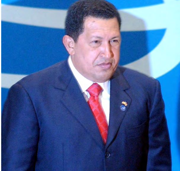
Hugo Chavez.

Hugo Chavez has established himself as a left-leaning opponent of the United States and its allies in Latin America. Chavez openly praises the actions of rebel groups in US-allied Colombia like the FARC, which the United States and other nations have designated as terrorist organizations. These groups have a demonstrated track record of violence and drug smuggling. Chavez' readiness to support these groups based on a shared anti-American sentiment should come as no surprise to those who view Chavez' moves as calculated to ruffle feathers in Washington and Bogotá. However, given the recent strategic alignment of Iran and Venezuela, this also serves as evidence of his willingness to support far more unsavory organizations like Hezbollah.