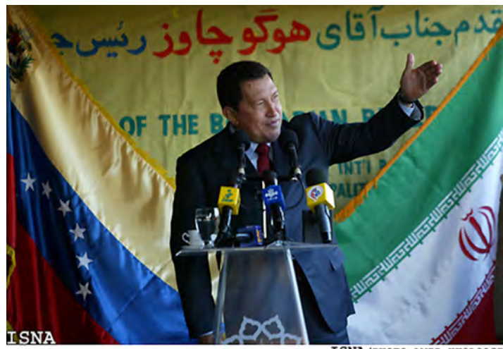
Hugo Chavez in Iran.

Chavez’ Venezuela and Iran share pariah status in the United States, and both claim leadership of nations dedicated to creating a multi-polar world no longer dominated by America. In a meeting with Iran’s supreme leader Ayatollah Khamenei in July of 2009, Chavez agreed to enhance the two states’ cooperation, both economically and politically. Khamenei called on the two nations to “consolidate the newly-formed independence front,” with Chavez agreeing that both Iran and Venezuela “should help revolu-