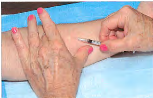
Figure 3. Intradermal injection of Sanaria™ Vaccine

Malaria vaccine development benefits from two key advantages not shared by vaccines for most other neglected diseases and diseases of poverty. First, a safe, reproducible experimental challenge system allows for multiple, relatively small studies in volunteers in the developed world. Second, because there is a developed world market, one can anticipate licensure of the vaccine for use in these countries by regulatory authorities like the FDA, the European Medicines Agency (EMA), and comparable institutions around the world. We have reasoned from the outset that such approval for use in the developed world will speed deployment and widespread uptake of the vaccine in the developing world. 31 Thus, we plan to move forward with an integrated clinical development plan. The goal is to achieve licensure of the vaccine in the developed world for all non-pregnant individuals except young infants, followed rapidly by licensure in the developing world, first for the same populations, and then for young infants and pregnant women. This clinical development pathway will involve studies both in experimentally challenged volunteers