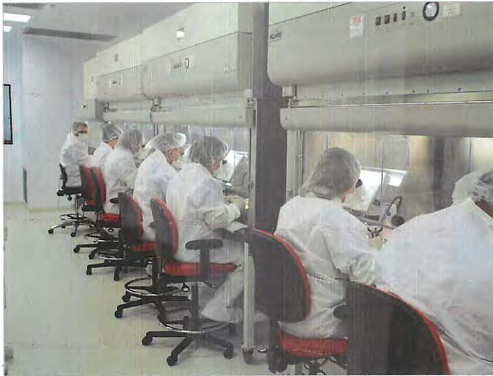
Figure 1. Dissection of salivary glands from P. falciparum sporozoite-infected mosquitoes. This process is carried out under aseptic conditions in compliance with current Good Manufacturing Practices in Sanaria's clinical manufacturing facility.

to know what resources will be required to produce adequate quantities of PfSPZ.