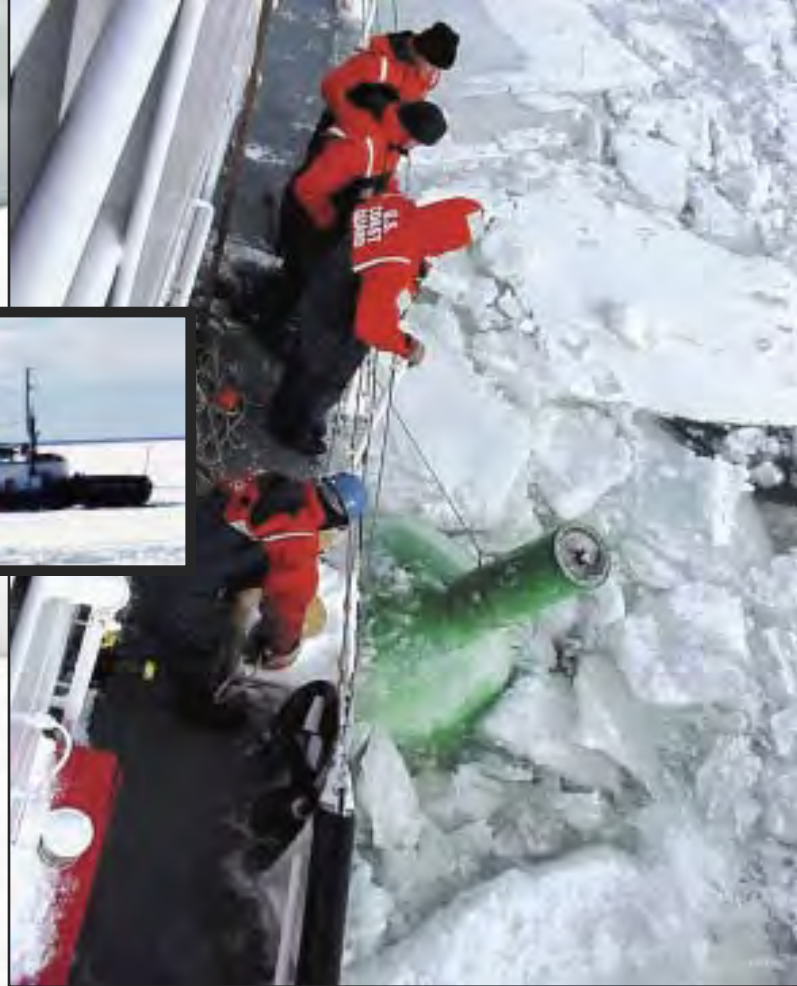
CGC Katmai Bay breaks ice to service an extinguished ice buoy.