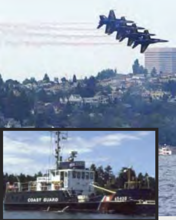
The Inland Buoy Tender, Coast Guard Cutter Bayberry , enforces a safety zone while the U.S. Navy "Blue Angels" perform at Seattle's 2003 Seafair.