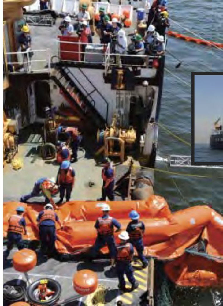
CGC Juniper's spilled oil recovery system.