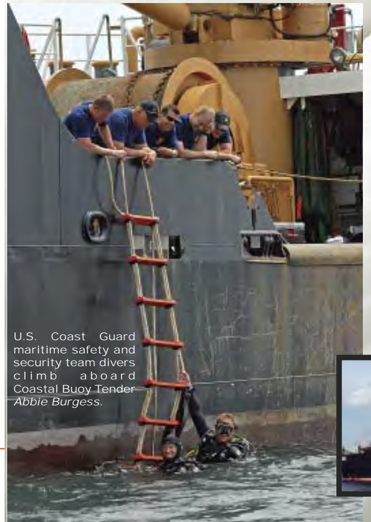
U.S. Coast Guard maritime safety and security team divers climb aboard Coastal Buoy Tender Abbie Burgess.