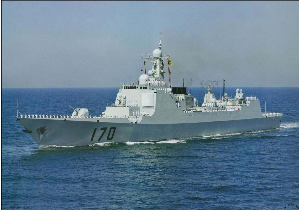
Figure 6. Luyang II (Type 052C) Class Destroyer