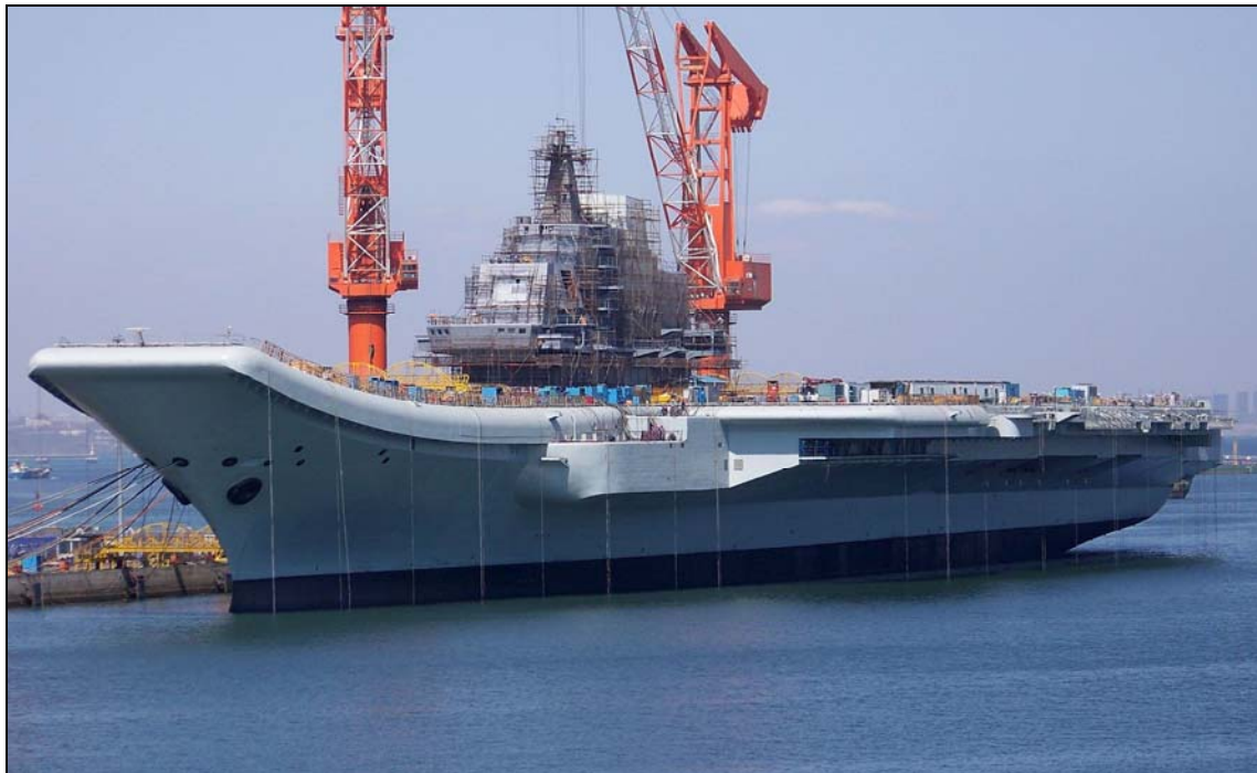
Figure 5. Ex-Ukrainian Carrier Varyag Being Completed at Shipyard in Dalian, China