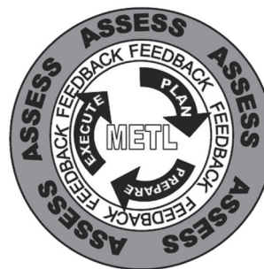
The Army training management model (Figure 4-5 from FM 7-0) 4