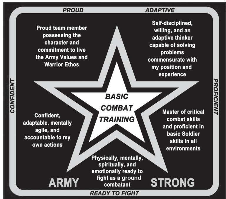
Figure 1. The five outcomes (Fig. 1-1 from The Drill Sergeant Handbook ) 2

We see this formula as lieutenants take charge of their first platoons. We also see it in every rotation at the National Training Center, the Joint Readiness Training Center, and the Joint Maneuver Readiness Center, where the observer-controllers allow Soldiers to take chances and calculated risks in a controlled environment. They teach