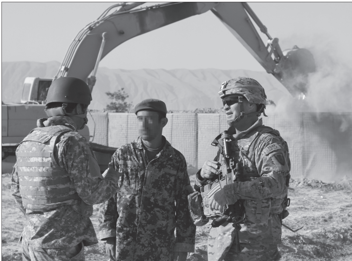
A U.S. heavy equipment operator (right) uses his translator to mentor an ANA engineer (left) during a partnership construction project.