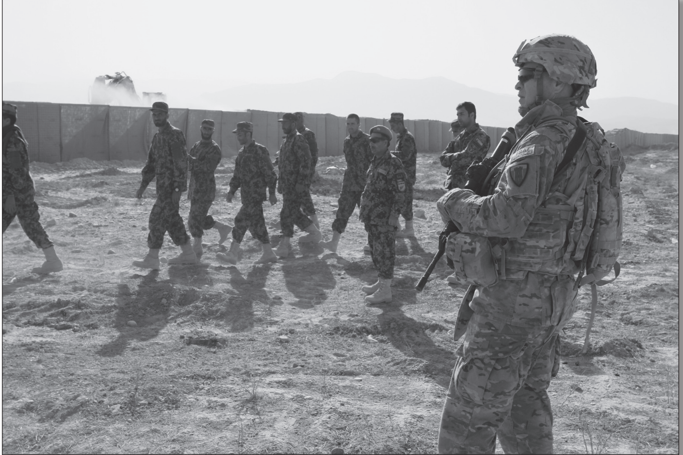
A Task Force Roughneck engineer supervises Afghan engineer training in Balkh Province.