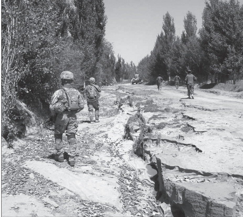
Soldiers from Task Force Gridley and an ANA route clearance company work together to clear a route in Paktika Province.

influx of new units being created. The slow progress makes it tempting to give the ANA a handout, but U.S. and Afghan leaders are seeking long-term solutions.