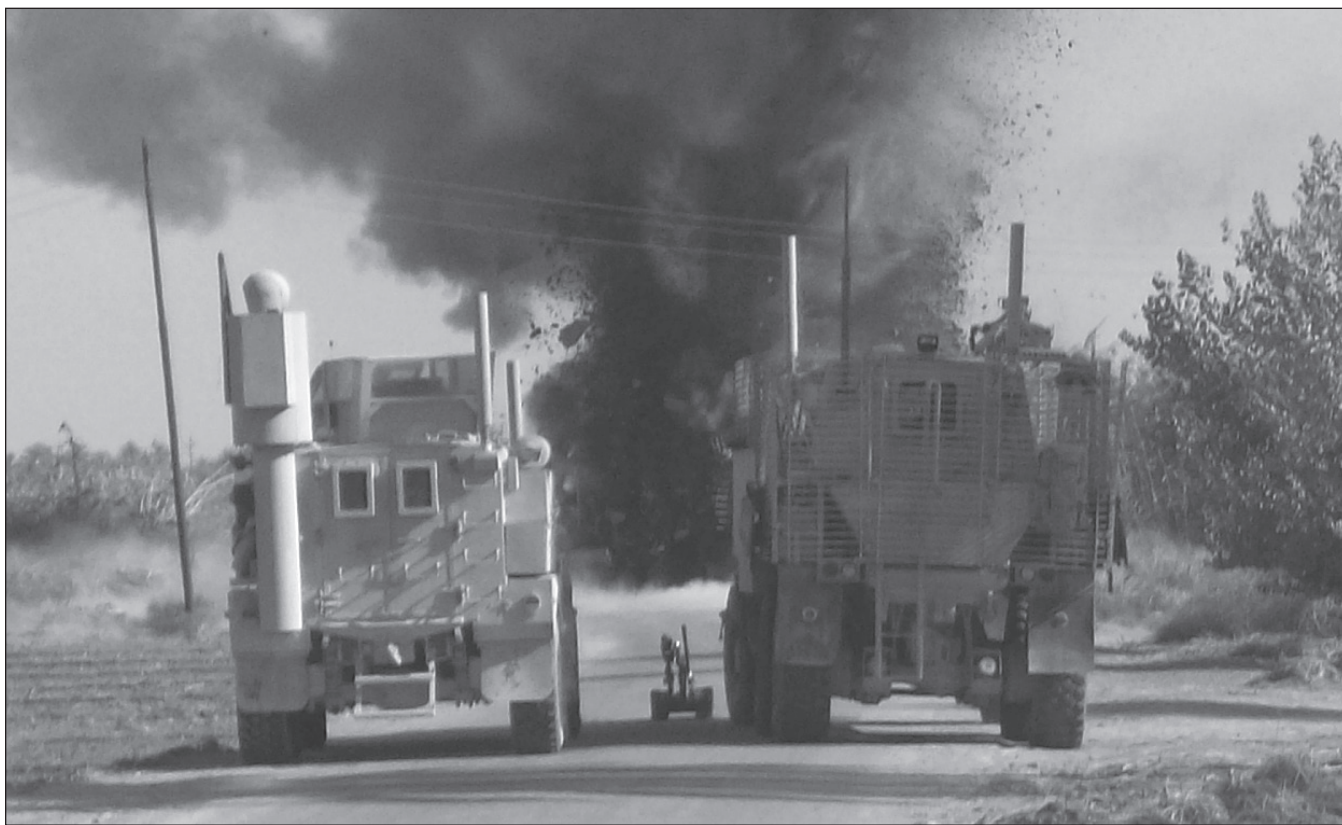
Second Platoon's TALON robot (center) returns after emplacing C-4 on a positive find.

Route clearance operations and refresher training became the top priorities as Charlie Company continued its transition with Bravo Company, hindering the change-of-command inventory schedule. Training was scheduled to allow each platoon a day to refit, permitting time to conduct inventories and prepare for the next day's mission. This illustrated the old maxim that the mission comes first. The company's supply team members were recognized by the commander of Multinational Division–Center for their