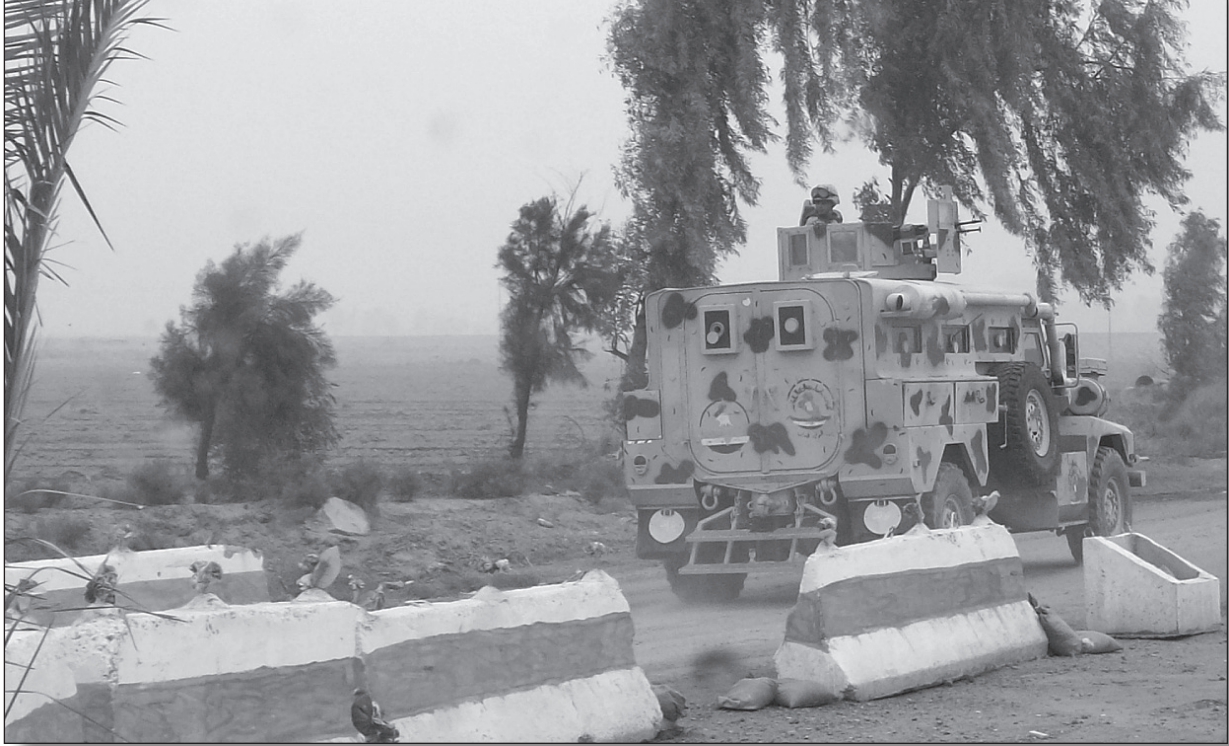
Charlie Company Soldiers follow as their Iraqi partners take the lead on a route clearance patrol.

efforts to ensure that inventories ran as smoothly as possible.