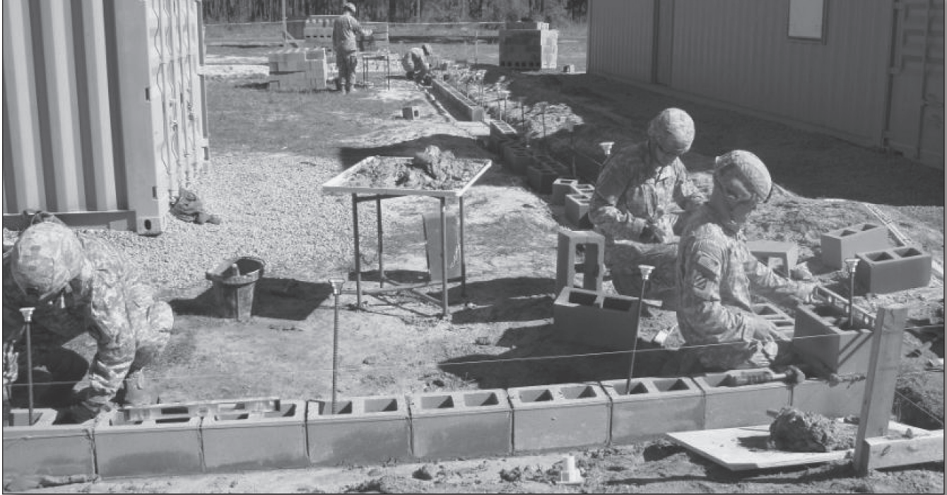
Soldiers from the 92d Engineer Battalion lay the first course of a concrete masonry unit wall.

Table III. Table III, the run phase, is the culminating training event in which companies will design and construct their own capstone project. The project will be larger than the Table II project and will have an outside agency as the customer. Since there is an actual customer, all initial designs and project packets will be synchronized with the battalion and the company. Once the project packet is complete, it will be sent to the customer for approval. Due to the typical six-month waiting time that DPW and the Directorate of Contracting require for all projects, the project packet must be submitted during the first phase. This will require the battalion-level construction officer to do all initial planning and coordination with the customer at the start. Once the company reaches the third table, then in-progress reviews between battalion and company will begin and the company will plan the actual project packet.