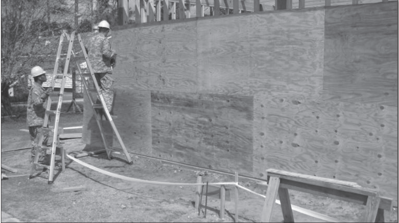
Carpenters train on their skill level one tasks.

company can start over and begin the second iteration of Tables I through III. This will allow for all the Soldier and leader transitions during that six-month period.