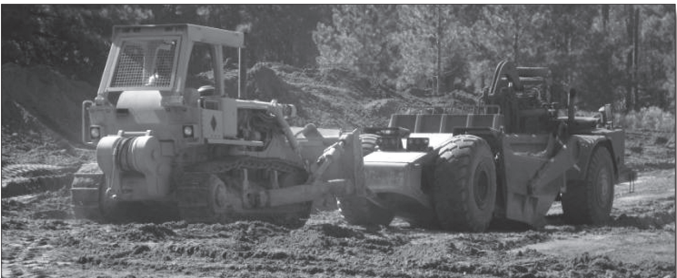
A Soldier uses a D7 bulldozer to push-load a scraper.

T he timeline for this type of training is spread throughout the year. The training will be biannual, with the first qualification tables starting in Month One and ending in Month Six. Table I will take place at the beginning of the course and will typically take a month to complete. This leaves five months to complete the small and capstone projects during Tables II and III. Performance of Table II will determine if Table III can actually be accomplished. If the company's Soldiers are ahead of schedule during Table II and appear to be retaining their STP skills, then the battalion may allow the company to continue on to Table III once Table II is complete. On the other hand, if the Soldiers are falling behind and not retaining their STP skills, Table III can be cancelled and Table II extended to the end of the six-month period. Once that period is up, the