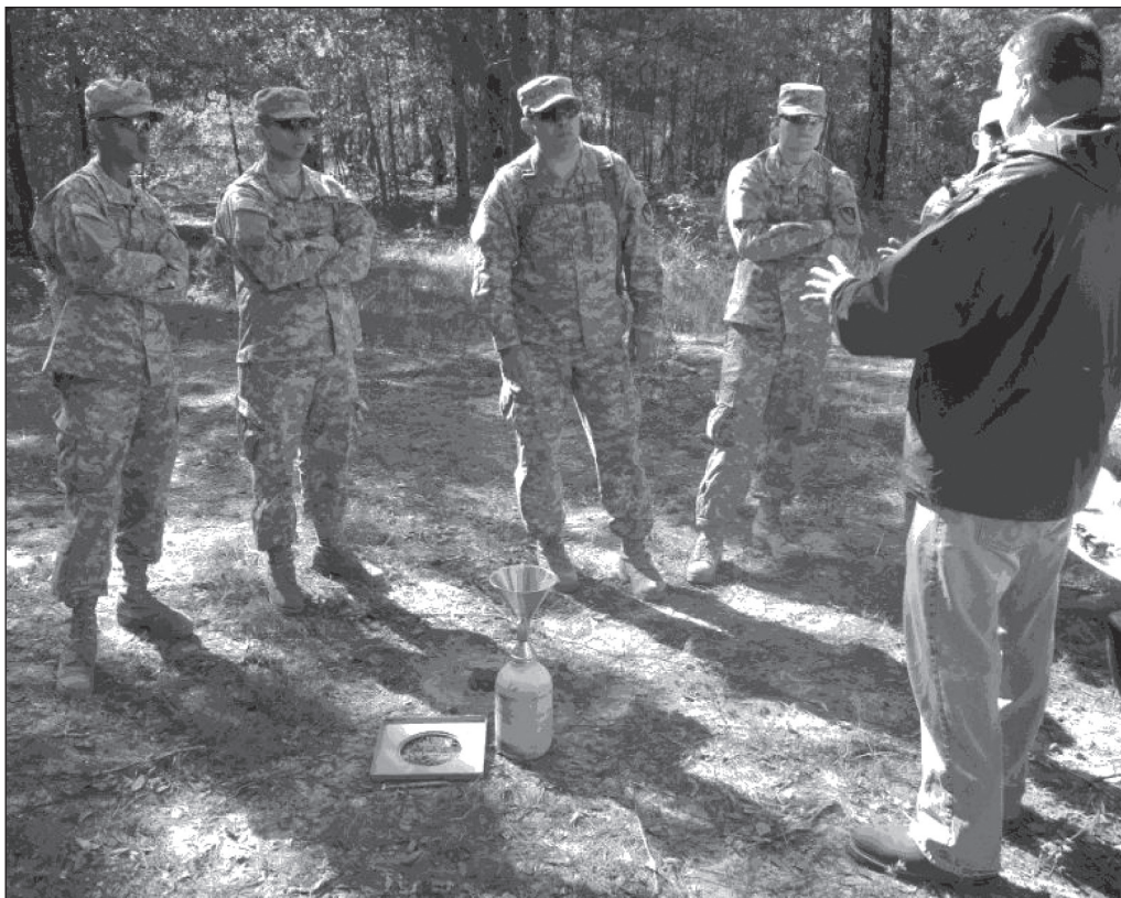
Military surveyors receive a class on soil analysis during Table I training.