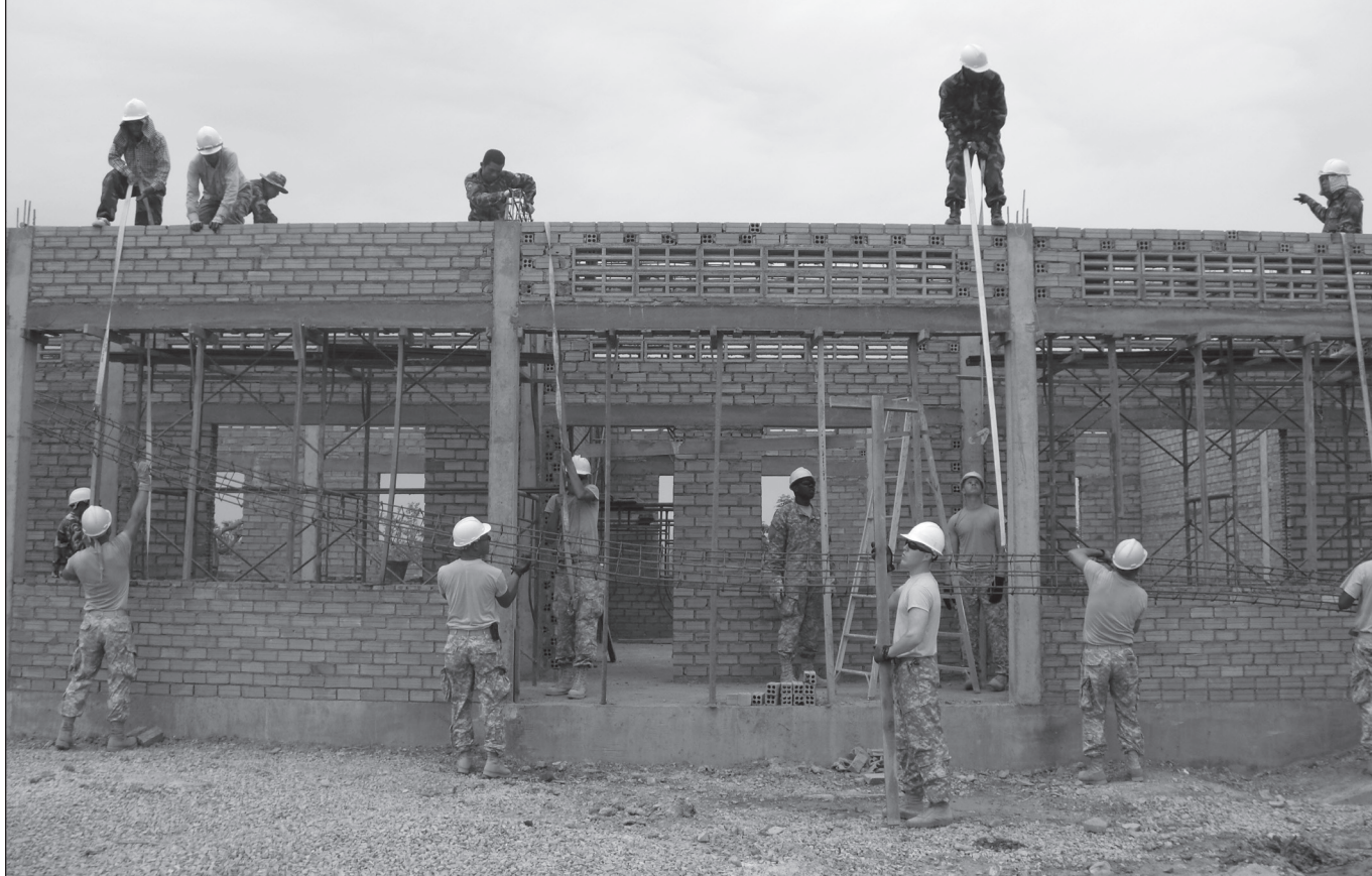
American and Cambodian engineers work together to lift rebar into place.

unsafe. Dissatisfied with the Cambodian head engineer's alternatives, U.S. project leaders developed a new plan to build a truss system. The trusses had to be made of steel, since available lumber was of poor quality and American-style timber trusses would lack longevity in the Cambodian climate. At this point in the project, the diverse skill sets of the U.S. team members became mission-essential. Welders from the Forward Support Company, 52d Engineer Battalion, welders from the Cambodian contingent, and a handful