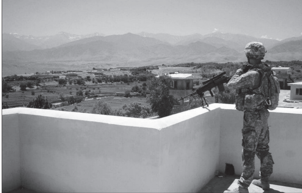
An engineer Soldier provides security during a meeting with tribal leaders.

Large printouts of each village, without any added graphics or layers, formed the centerpiece for our discussions. The village elders understood the imagery much better when it was oriented on a horizontal surface, rather than hanging on the wall. Once, after an especially grueling 2-hour session, all of our work had to be redone when the elders discovered that we had not oriented the mountains on our imagery toward the real Tora Bora Mountains and all the features had been identified at the wrong end of the map.