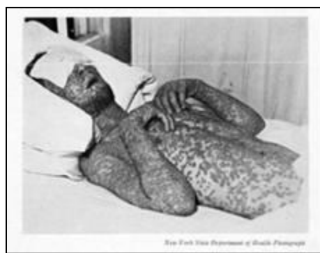
Figure 3: Human Infected with Smallpox Virus

In 2001 Anthrax-tainted letters sent through the Post office, killed five and infected twenty-two people. While the number of casualties was low, the ensuing panic shut down postal delivery across the country and reinforced fears raised by Al Qaeda’s attacks in New York City and Washington DC. In the climate stemming from those attacks, United States policy makers considered nation-wide smallpox vaccinations to preempt a terrorist use of smallpox. The effects of smallpox after the on-set of symptoms are illustrated in Figure – 3. 17