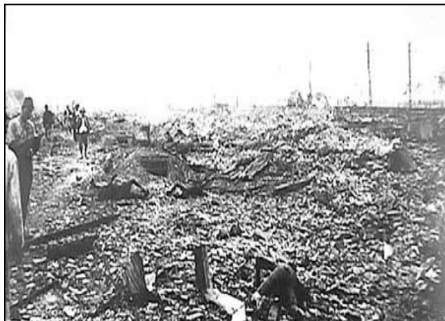
Figure 1: Hiroshima after Atomic Bomb Detonation

When the fire burnt itself out, there appeared a completely changed, vast, colorless world that made you think it was the end of life on earth. In a heap of ashes lay the debris of the disaster and charred trees, presenting a gruesome scene. The whole city became extinct. Citizens who were in Matsuyama Township, the hypocenter, were all killed instantly, excepting a child who was in an air-raid shelter. 7