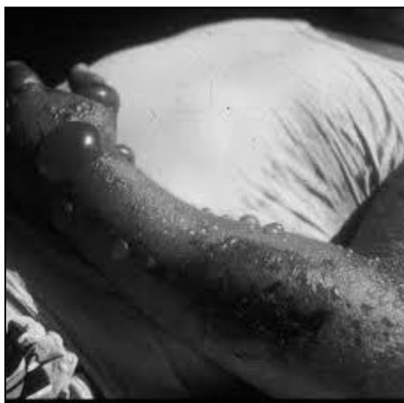
Figure 2: Human Arm Exposed to a Blister Agent

Figure-2 depicts a human arm exposed to a blister agent. Blister agents, such as mustard gas, are in the chemical agent category that exhibit the greatest persistence in the environment. 15