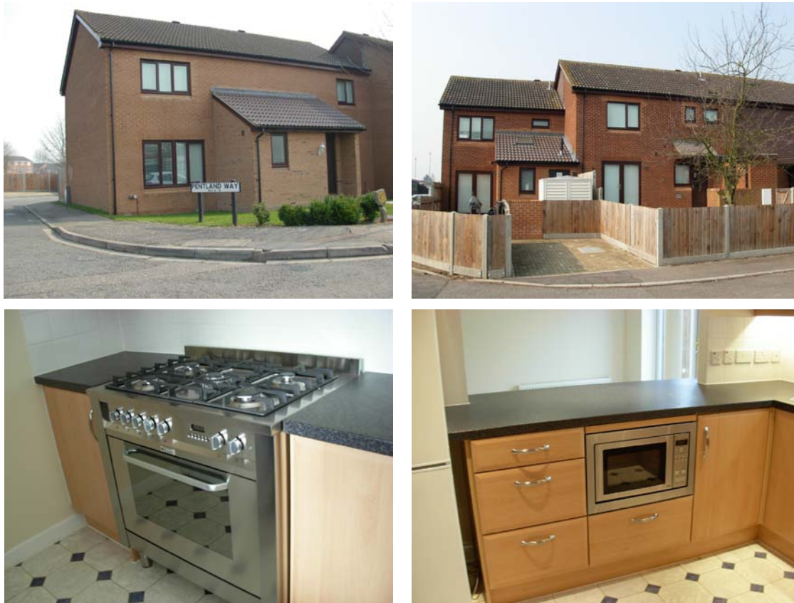
Figure 1. Renovated Housing Units at West Ruislip, March 2007

Navy real estate personnel visited the housing units and took pictures in March 2007. As Figure 1 indicates, the housing was in excellent, like-new condition upon return. On March 30, 2007, the Assistant Secretary of Defense for Public Affairs announced that the United States would cease operations at West Ruislip 18 and in September 2007, the Navy turned over the housing units to the U.K. MOD.