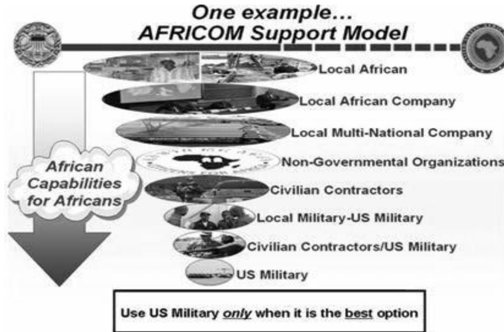
Figure 8: U.S. AFRICOM's Adaptive Logistics Network (ALN) concept 26

resources include, but are not limited to all of the active ports, railway, airports and roads located within the region. This detailed report will allow AFRICOM to determine not only the location and capabilities of active resources but also assist in determining the most likely and best courses of action for the transportation of logistical supplies within the local region.