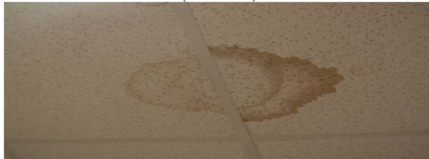
Figure 1. Residue From Roof Leaks (NOSC Office)

Building tenants explained that during periods of heavy rain, water leaks were visible, as shown in Figures 1 and 2. Deficiencies might lead to other major problems, such as mold and mildew, if not corrected.