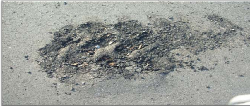
Figure 3. Asphalt Beginning to Deteriorate (NOSC Exterior Parking Lot)

Building tenants also stated that asphalt on the utility parking lot started to deteriorate during vehicle usage. Tenants stated that the asphalt broke apart when the Marines' truck wheels turned sideways (as shown in Figure 3), and the asphalt sank when forklifts remained parked for extended periods of time (as shown in Figures 4 and 5). The tenants also stated that this deficiency would lead to future problems with moving the trucks and properly operating the forklifts.