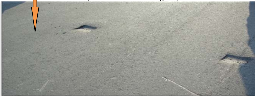
Figure 5. Asphalt After a Vehicle Has Been Parked (NOSC Exterior Parking Lot)