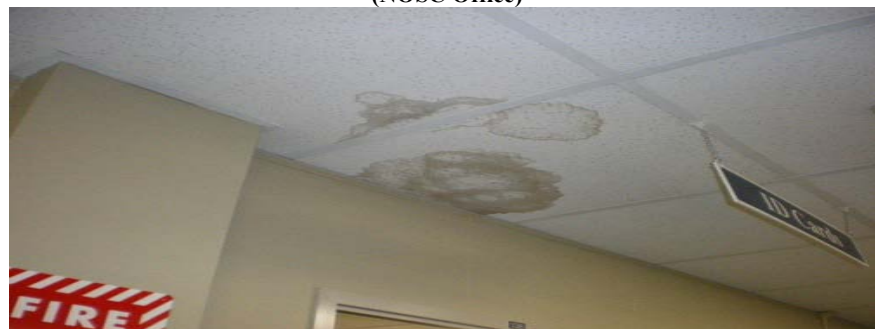
Figure 2. Residue From Roof Leaks (NOSC Office)