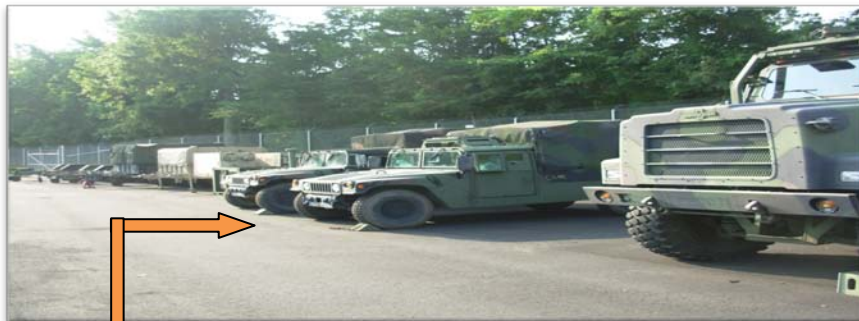
Figure 4. Vehicle Parked (NOSC Exterior Parking Lot)