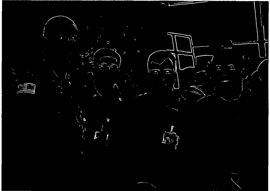
NIST and Task Force Eagle personnel with Senator John McCain (on right) during a Congressional visit to Tuzla, Bosnia. February 1996.