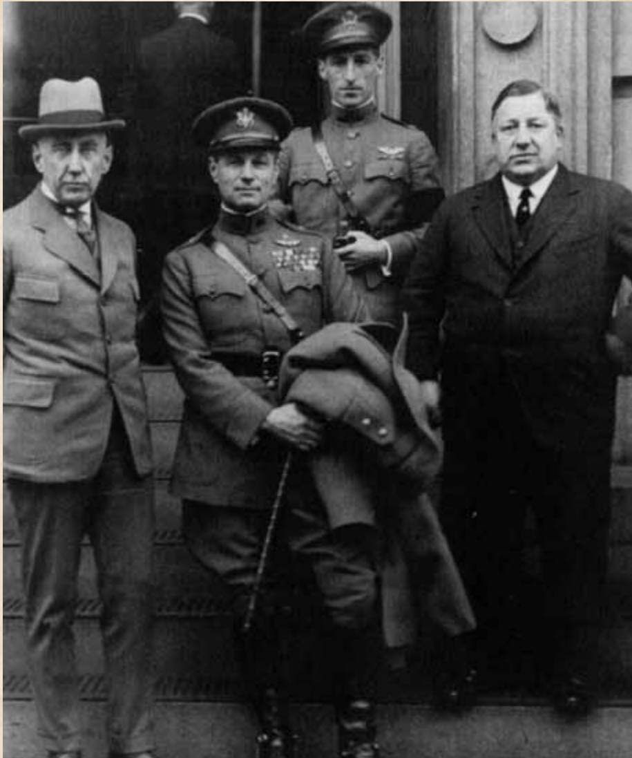
Immediately following World War I, Gen William (“Billy”) Mitchell (first row, center) identified the need for target intelligence officers at the staff and unit level.