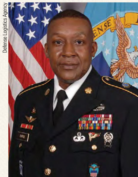
Army Command Sgt. Maj. Otis Cuffee

The requirement to deploy with the unit's loads still holds true today. However, we have seen many of our rotational units fall in on left-behind equipment in operational theaters. Since units fall in on equipment left by previous units, a majority of our sustainment functions have been accomplished by the Logistics Civil Augmentation Program, known as LOGCAP. Many units deploy with little or no basic or prescribed loads. LOGCAP plays a major role in support