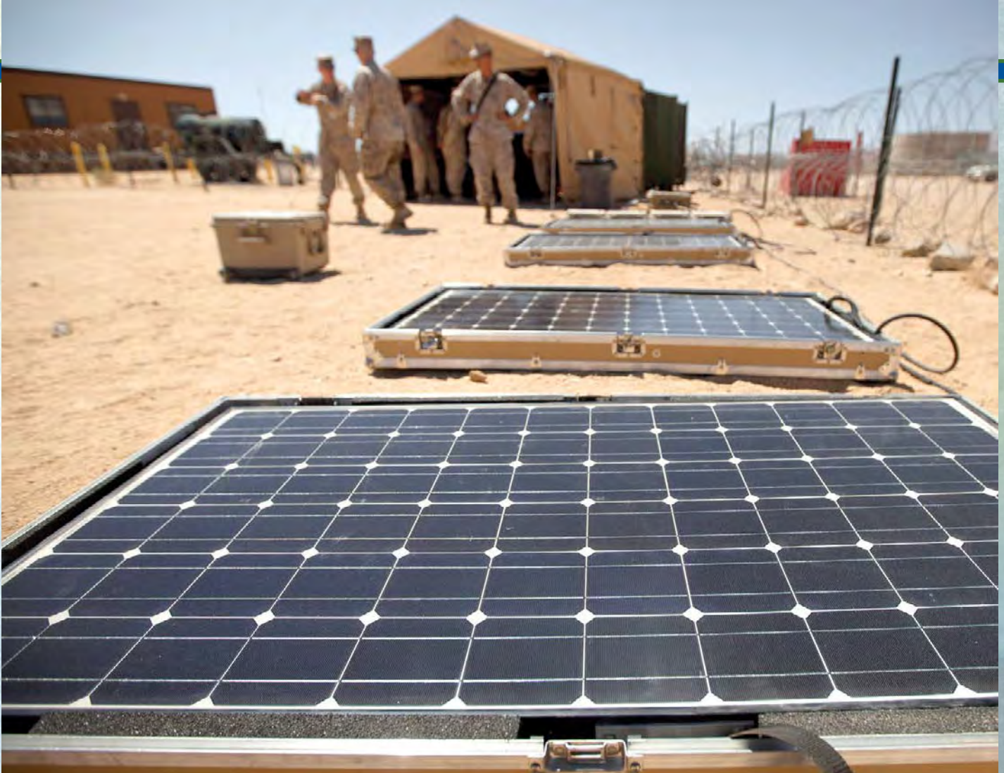
Marines set up a Ground Renewable Expeditionary Energy Network System that will provide power to an entry control point. DLA Energy provides cost-effective, reliable energy solutions in support of Defense Department missions.

as DoD's central procurement agency for direct supply natural gas, is actively managing multiyear contracts valued in excess of $500 million for the supply of more than 110 million dekatherms, a form of measurement for energy.