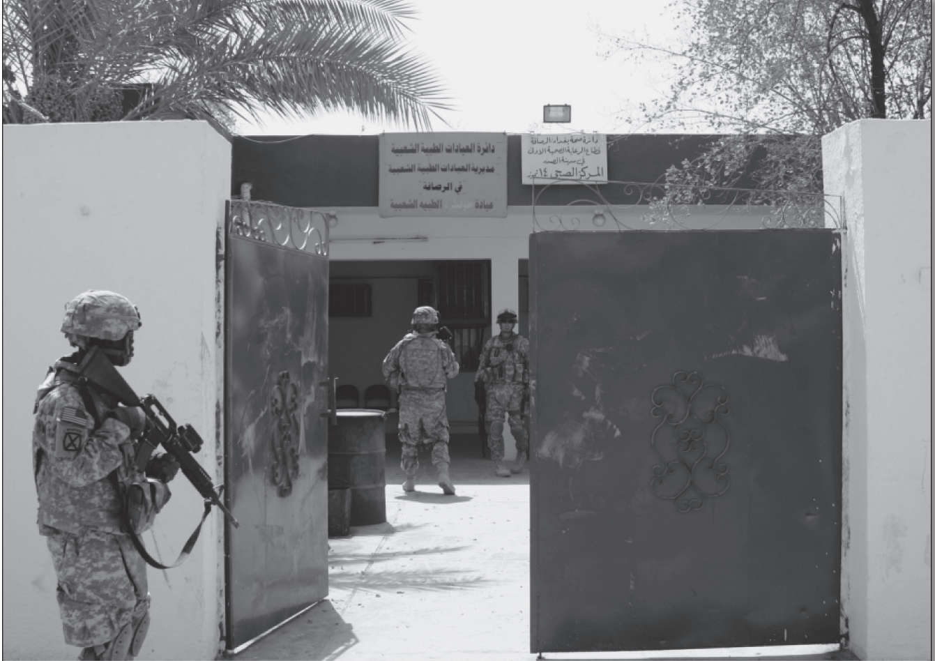
Soldiers enter the public clinic for inspection of local contractor work.

number of Soldiers. The objectives for a typical patrol consisted of checking six to eight projects that required a team to dismount and three or four projects that could be evaluated while mounted. Such missions took three to four hours from assembly to return to base. The return to base did not finish work for the day though. QV teams had to prepare reports for each project and a daily summary for 4th Infantry Division—and eventually Multinational Force—headquarters. These reports usually took five to six hours and another hour was spent in a daily briefing to the task force commander.