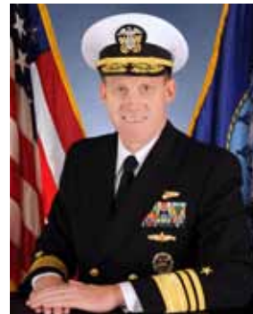
MICHAEL S. ROGERS Vice Admiral, U.S. Navy Commander, Fleet Cyber Command/ Commander, TENTH Fleet