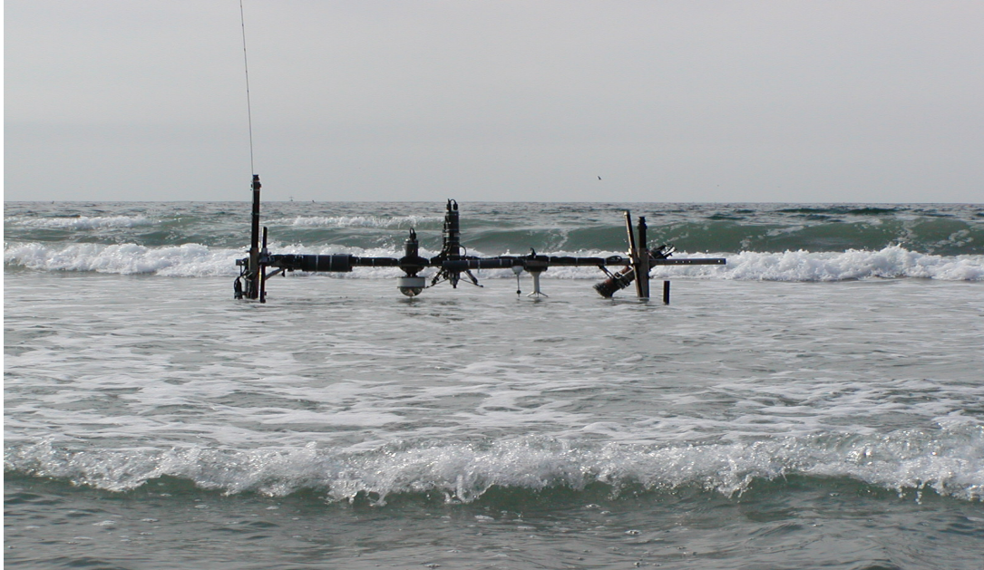
Figure 2. The NPS bottom boundary layer frame at low tide during NCEX. From left to right are located the scanned altimeter, BCDV velocity and sediment profiler, reference EM current sensor, ADV, and bed imaging camera, all of which were submerged through the high half of each tidal cycle. The instruments are approximately 1m above the bed.