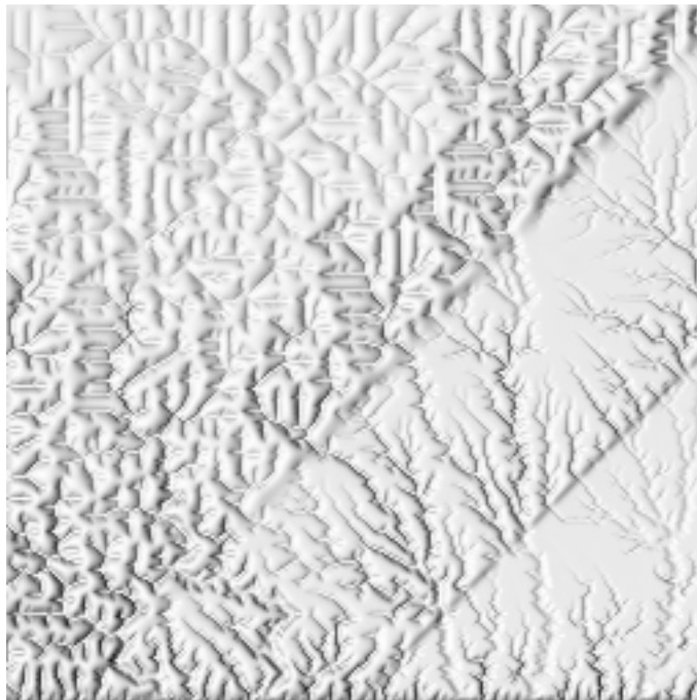
Figure 3. Simulated Coastal Plain landscape. The lower boundary is the controlling base level, assumed to be the bank of the Potomac River. The simulated domain is about 5.1 by 5.1 km.