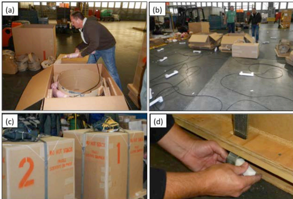
Figure 1. Buoy preparation at the Alaskan CG station in Kodiak. (a) UpTempO buoy in air-deployable cardboard box. Visible is the thermistor cable (black) with thermistor housings (white, in pink bubble wrap). A. Sybrandy of PG is holding a thermistor housing. (b) Thermistors laid out and ready for battery insertion. (c) The two buoys packed for deployment with parachutes (on top) and straps (gray). The straps hold the cardboard box against the palette. (d) salt block at the end of a parachute strap; when this dissolves in the ocean, the straps and outer box fall away from the buoy as it releases the thermistor string into the water.