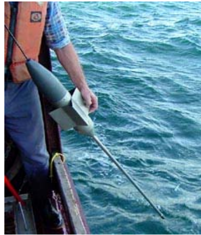
STATPEN being lowered with CTD winch and PROBOS being hand launched

PROBOS is an improved version of the Canadian “STING” penetrometer with the same dimensions and shape as the STING but with additional capability of being able to display both the force on the tip as well as the deceleration of the unit without the necessity of recovering the probe and downloading the data with each deployment as is the case with the STING.