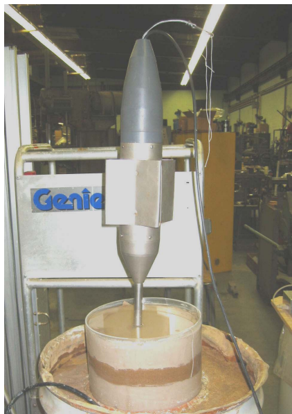
24" drop into layered specimen on loose sand

Results of the tests performed during the GYRE 10 and 06 cruises have been described in two preliminary reports (Stoll, Sun and Bitte, Nov. 2001 and Stoll, Sun and Bitte, Jul, 2002) and a more detailed report (Stoll, Sun and Bitte, Jun 2003). In addition, numerical and graphical results were posted for electronic downloading on the ONR Mine Burial Web Site. Based on the information in these reports a paper was presented in Baltimore in October 2004 at the ASCE conference "Civil Engineering in the Oceans, VI" (Stoll, 2005) and a paper (Stoll, Sun and Bitte, 2006) has been submitted for inclusion in a special issue of the IEEE Jour. Of Oceanic Engineering that is being edited by guest editors R. Wilkens and M. Richardson.