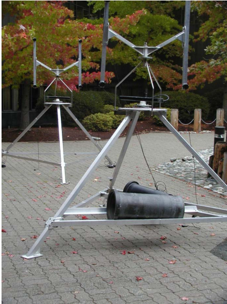
Figure 2. Propagation sonars and sidescan back scatter sonars mounted on two tripods prior to deployment in Narragansett Bay.

The bistatic measurements will be acquired with a square array of source/receivers using a 1m baseline. Sidescan sonars will be mounted on motor drives. The entire system will be deployed in Narragansett Bay close to the dock at the University of Rhode Island.